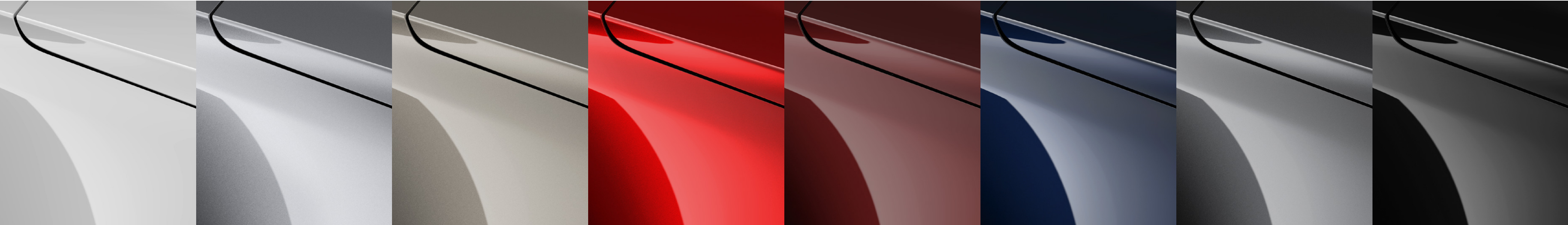
Rhodium White Metallic~