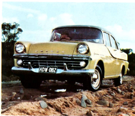
The Rough Track. One mile of Proving Ground travel is estimated to equal four miles of ordinary road travel.

Millions of miles of rugged Proving Ground testing has established beyond doubt that Holden is the best car for Australia. Hundreds of millions of miles in the hands of over 700,000 Australian owners have proved that Holden is the finest value for you.