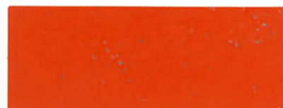
Infra red (Comb. No. 1850)