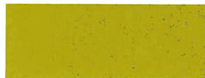
Lettuce alone (Comb. No. 1871)