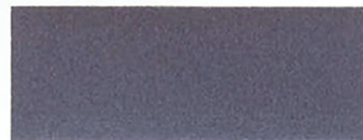
Ultra violet (Comb. No. 1859)