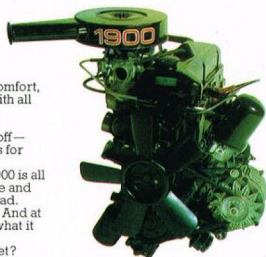
The 1.9 litre 4-cyl. cam-in-head German Opel engine.

What's it got under the bonnet? Well, turn on Torana's 1,897 cm 3 4-cylinder German Opel engine and you turn on 102 economical horses. This is the engine proved in 1.2 million German cars. Reliable. Economical. Cam-in-head for extra efficiency, particularly in miles per gallon.