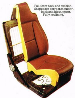
Full-foam back and cushion. Shaped for correct shoulder, back and hip support. Fully reclining.

The right car. The right back up. The right time to talk to your Holden Dealer. Take a test-run and find out for yourself why we call Torana 1900—the car for its time.