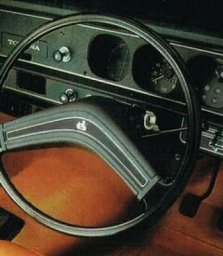
Fully padded steering wheel and recessed instruments.