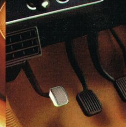
Foot operated parking brake.