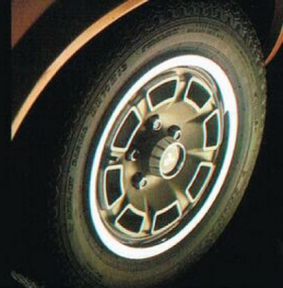
Steel sports wheels. Black wall radials. Fully wheel covers.