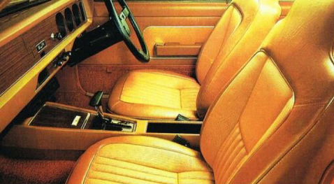
Foam bucket seats with integral head restraints. (T-bar auto, option illustrated)