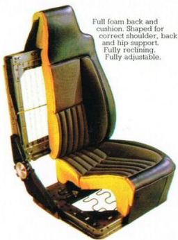
Full foam back and cushion. Shaped for correct shoulder, back and hip support. Fully reclining. Fully adjustable.

Safety is built into the Torana SLR. Like new, stronger bumper bars front and rear. Spaced out from the body to give more protection in traffic mix-ups. With rubber inserts that absorb