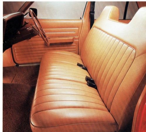
The new Kingswood full-foam bench seat.