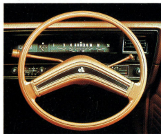
Kingswood's clear, easy to read dash.

The dash is safety padded, so is the steering wheel. Steering column is energy absorbing.