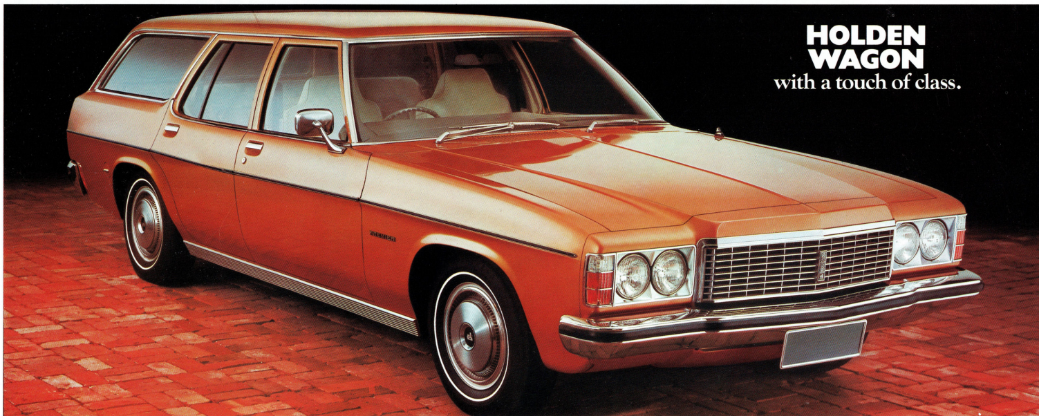
Holden Premier Wagon with its standard bumper impact strips and optional white-line tyres.