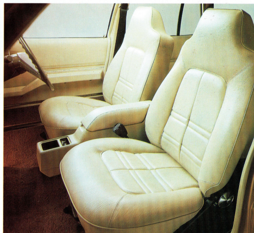
Premier Wagon's body contoured bucket seats.