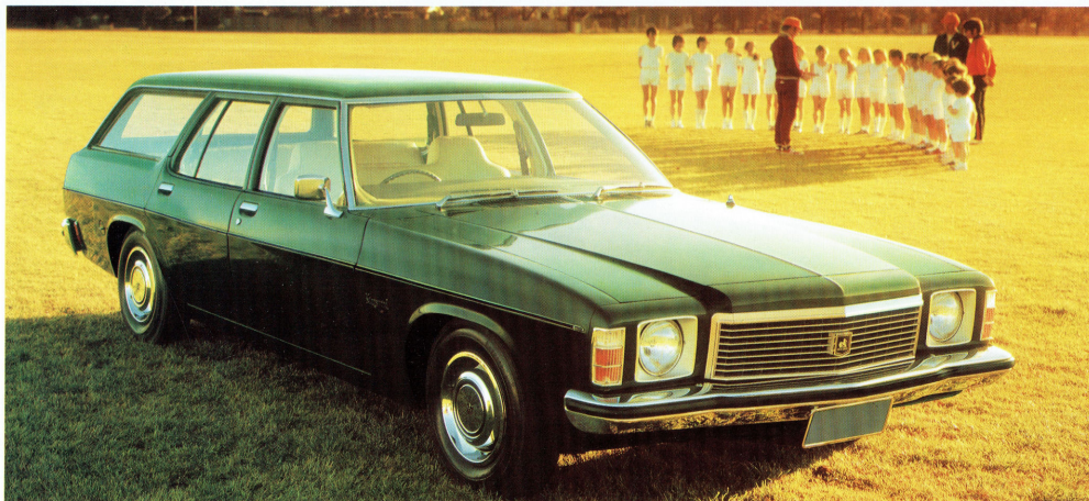
Holden Kingswood Wagon with optional wheel trim rings and bumper impact strips.