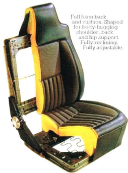
Full foam back and cushion. Shaped for body-hugging shoulder, back and hip support. Fully reclining. Fully adjustable.

That's what we call a healthy car. But if you think we've spent a power of time getting the performance and handling just right, wait 'till you step inside.