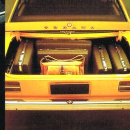
Big 10.8 cu. ft. (1.31 cu. metres) capacity boot.