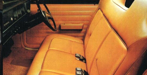
Full foam seats with integral head restraints.