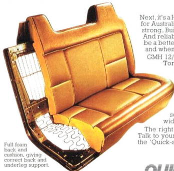
Full foam back and cushion, giving correct back and underleg support.

MORRISON'S HOLDEN 71-73 MAIN STREET, STAWELL PH. 61888