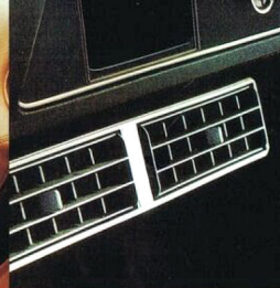
2-speed fan-boosted ventilation.