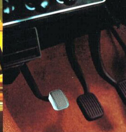
Foot-operated parking brake.