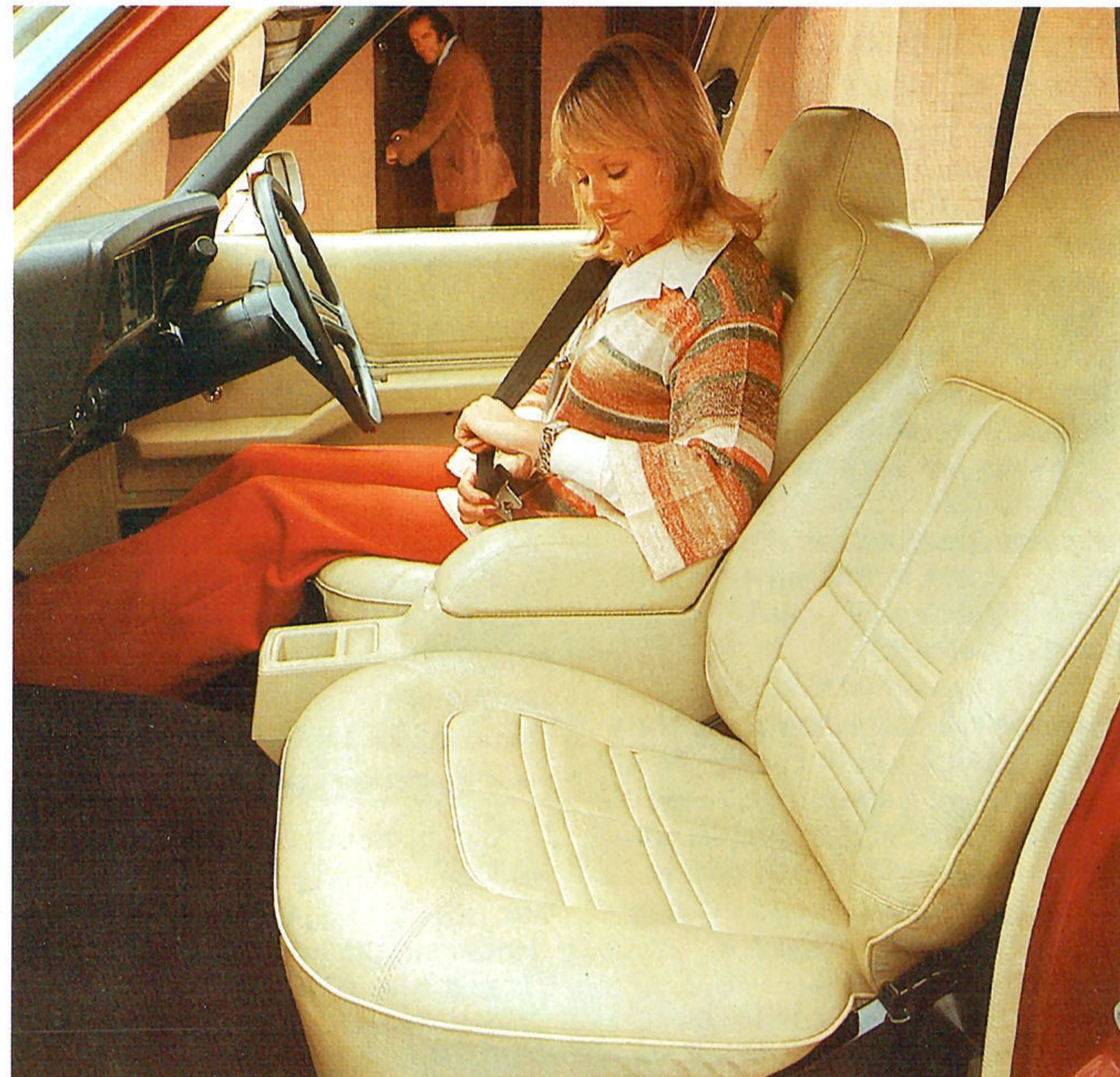
Resilient full foam front seats contour themselves to your body's contours for long-distance comfort and support. (Bucket seats standard on Premier Wagon.)