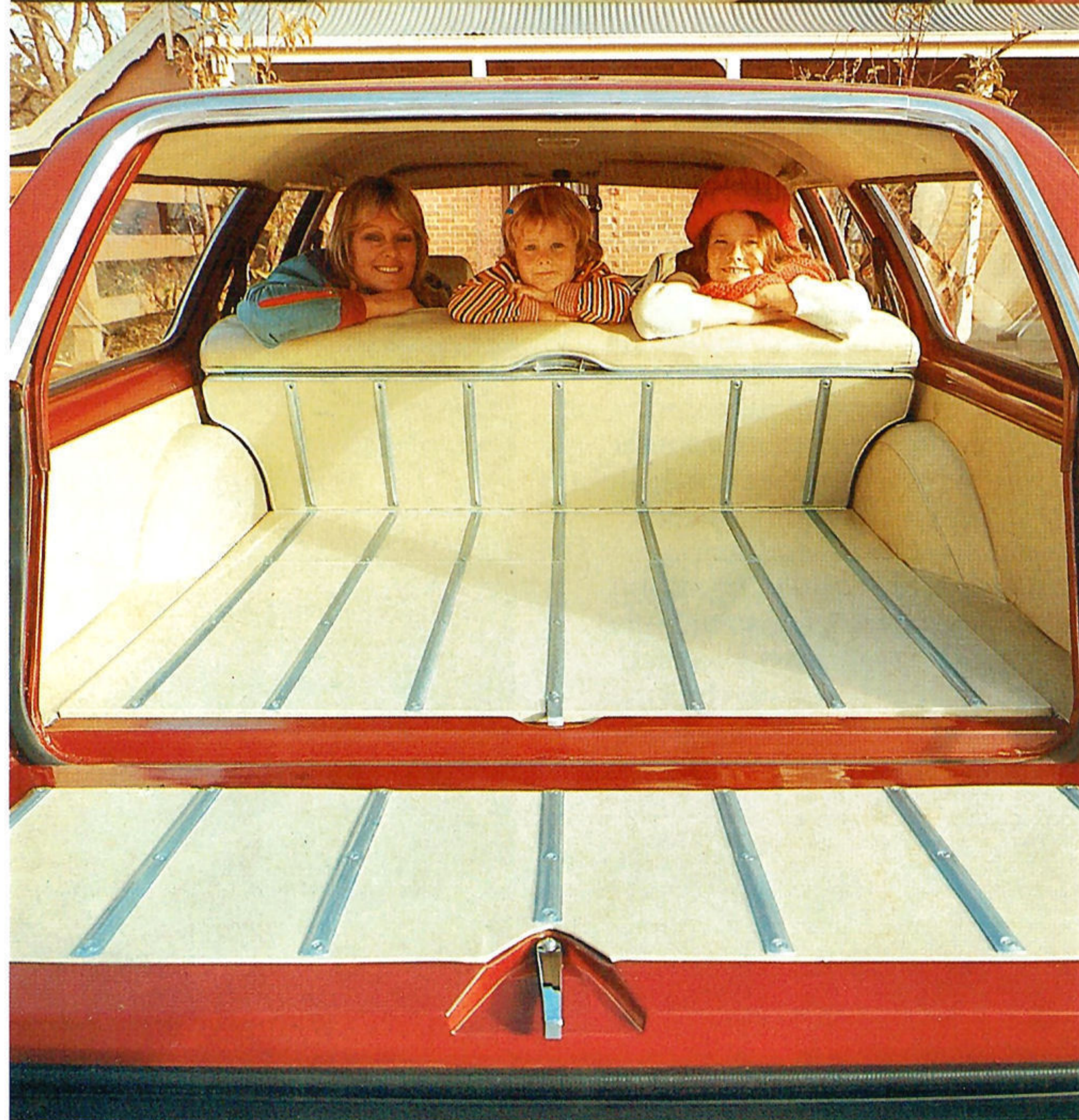
Out back, your Holden Wagon offers a lot more than family room. It's an inner space vehicle that's ready to pack up and go.