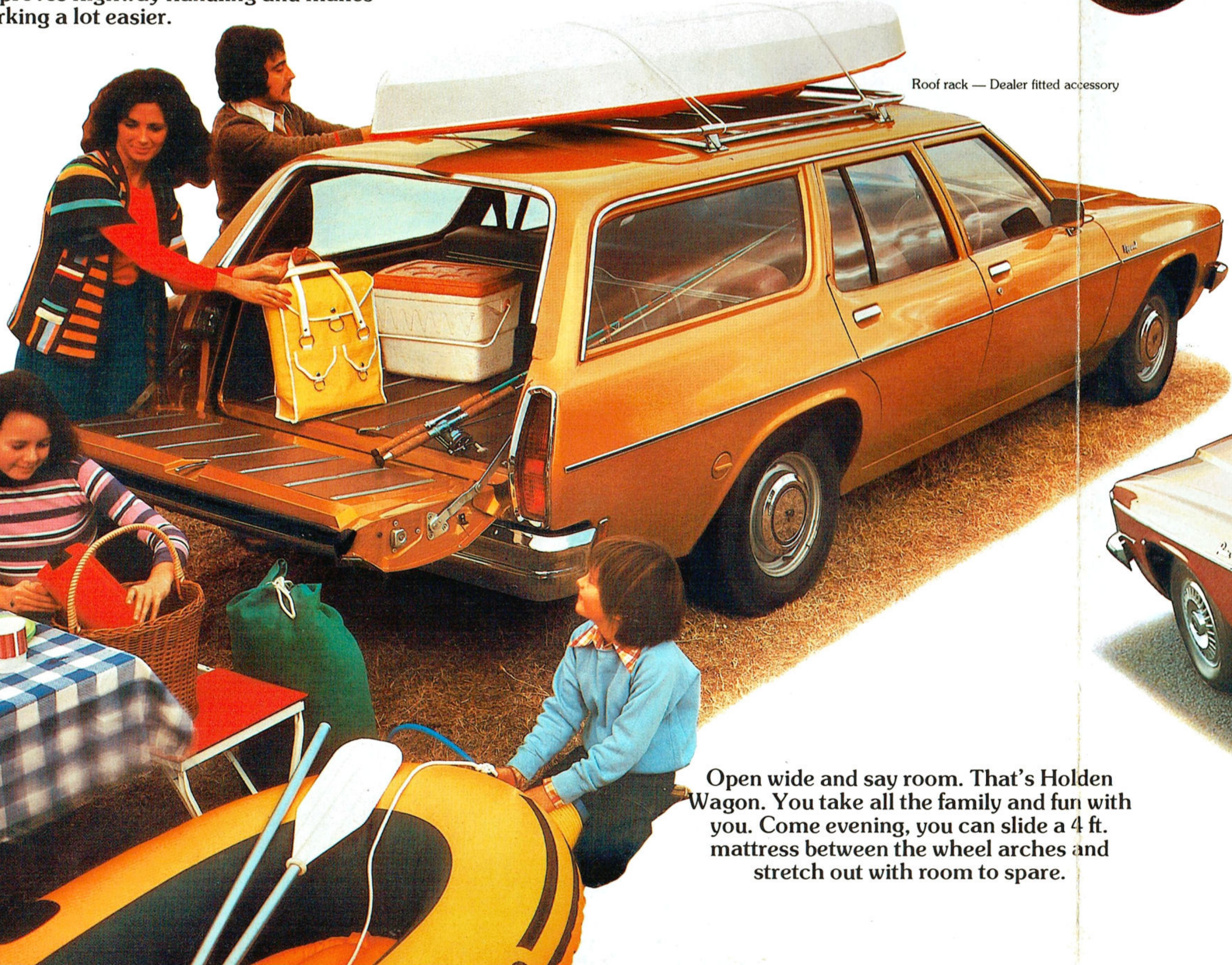
Roof rack — Dealer fitted accessory

Holden stands wide on a five foot track to give you great road stability. Holden's power-boosted flow-through ventilation brings in outside fresh air for inside comfort — even when you're standing still.