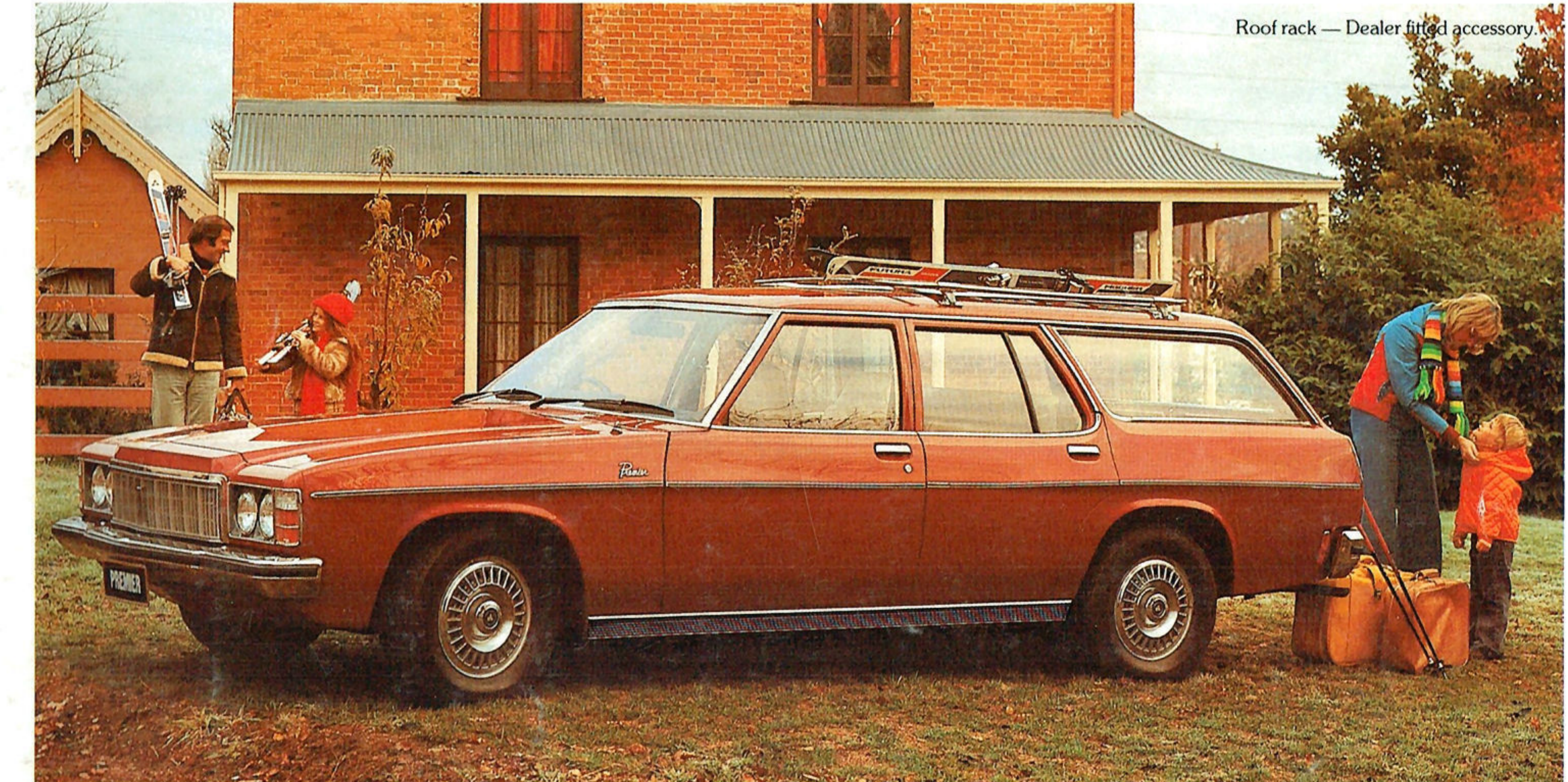
Roof rack — Dealer fitted accessory.