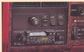
The Caprice stereo audio system.

Power operated door locking system. Bi-level integrated air conditioning with four upper and two lap outlets in the front and two in the rear.