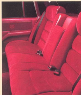
The magnificent rear passenger environment. More headroom, more luxury than ever before.

Electronic tachometer. Improved 5.0 litre engine. Turbo hydramatic transmission. Variable ratio power steering. Cigarette lighters and ashtrays integrated into the arm rest on each rear door. Height adjustable driver's seat. Integral head restraints on rear seats. Remote control exterior mirrors. Automatic power antenna. Hand-trimmed padded console. Intermittent wiper control. Improved Radial Tuned Suspension with steel-belted radial tyres. Rear seat passenger reading lamps. Tinted side and rear windows. Laminated windshield with tinted upper band.