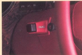
Highway Cruise Control.

Sink into the supremely comfortable deep foam seats, faced in your choice of deep pile plush velour or rich leather. They're designed to carry driver and passengers in superb comfort over the longest distances.