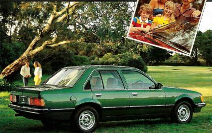
Commodore SL Sedan