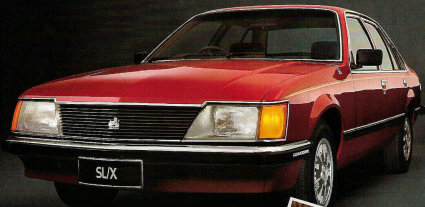
Commodore SLX Sedan