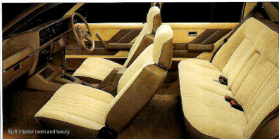
SLX interior room and luxury

Presenting your Commodore for '82, Australia's most advanced family car. With newly refined 4 and 6-cylinder engines for greater fuel economy. Smoother and lower front end styling. New rear styling. And exceptional weight-efficiency. Commodore offers a choice of two engines. The 4-cylinder 1.9 litre engine, and the 6-cylinder 2.8 litre engine. A new optional 5-speed manual transmission is also offered on Commodore, SL and SLX, allowing lower RPM on the highway, greater economy and quietness.