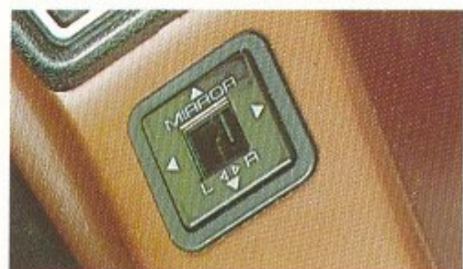
Finger touch electric adjustment exterior mirrors.

The 1985 Holden Calais, comprehensive equipment list includes electric exterior mirror adjustment, power windows, power central door locking, remote electric boot release, personal reading lamps and 4-wheel disc brakes.