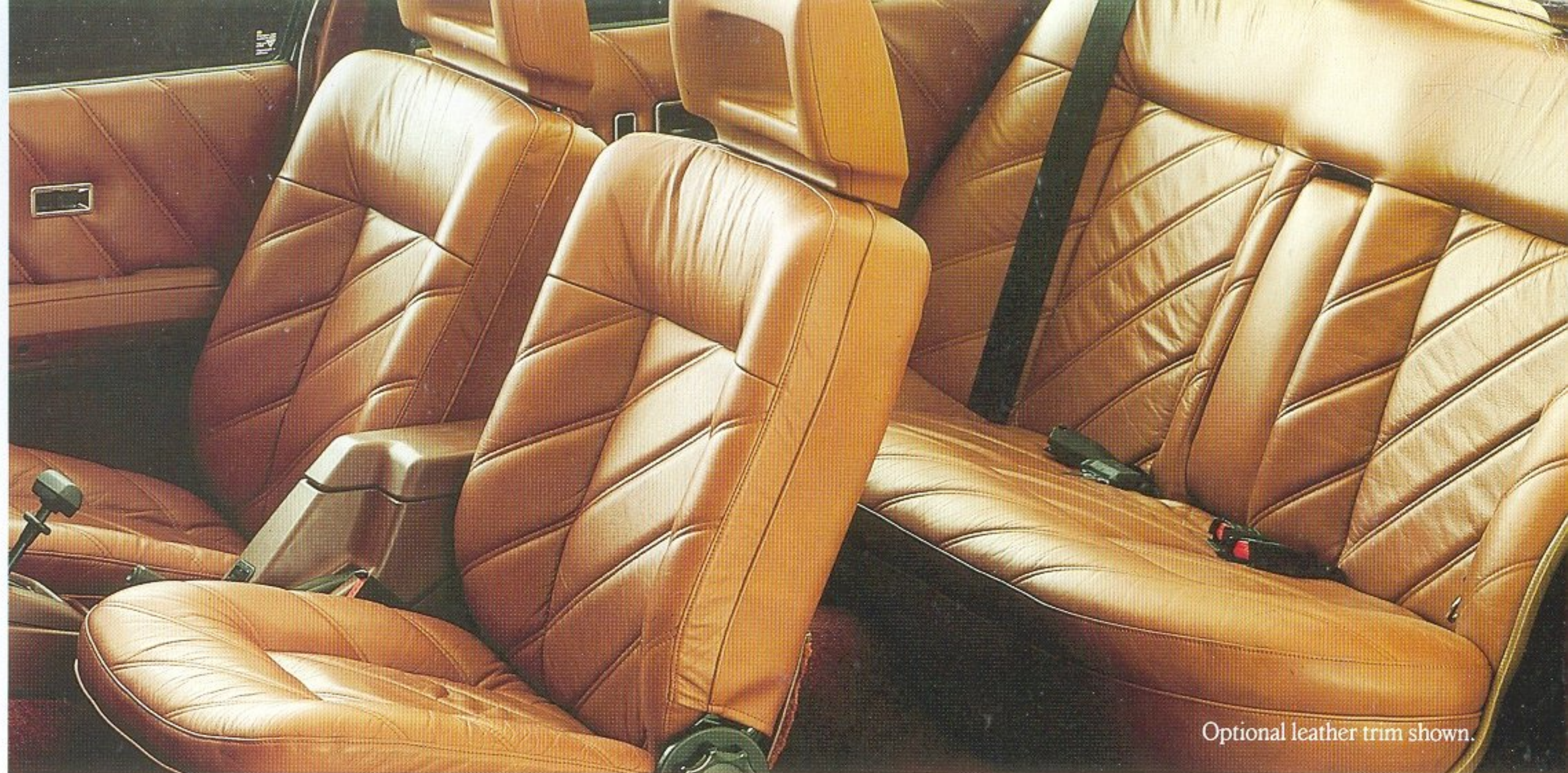
Optional leather trim shown.

Wherever you look, from its sophisticated electronic fuel injection power source to its aerodynamic lines and unparalleled interior appointments, the 1985 Holden Calais is very much world class at a level of excellence never before attained in an Australian car.