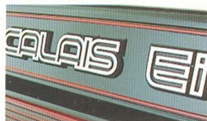
Electronic injection 3.3litre engine.

*Results of GM-H laboratory tests compared to VH Commodore.