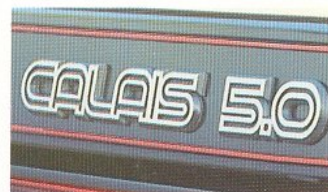
Optional 5.0litre V8 engine.