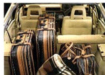
Split fold rear seats.