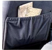
Storage pocket in rear of front seats.