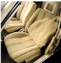
Reclining front bucket seats.

There's also an intermittent wiper mode, remote control for both exterior mirrors and a magnificent AM/FM electronic-tune radio with 2 speakers to surround you with your favourite music.