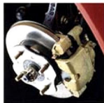
Power disc brakes.

And with the better than average 4.6 metre turning radius, it's also one of the easiest hatches to park.