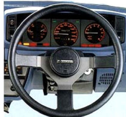
Sports 3-spoke steering wheel.