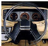
Tilt adjustable steering column.

In front of you there's a soft-feel steering wheel which is tilt adjustable, instruments that include fuel and temperature gauges, plus warning lights for oil pressure, brake and alternator failure, and one to let you know the handbrake is on.