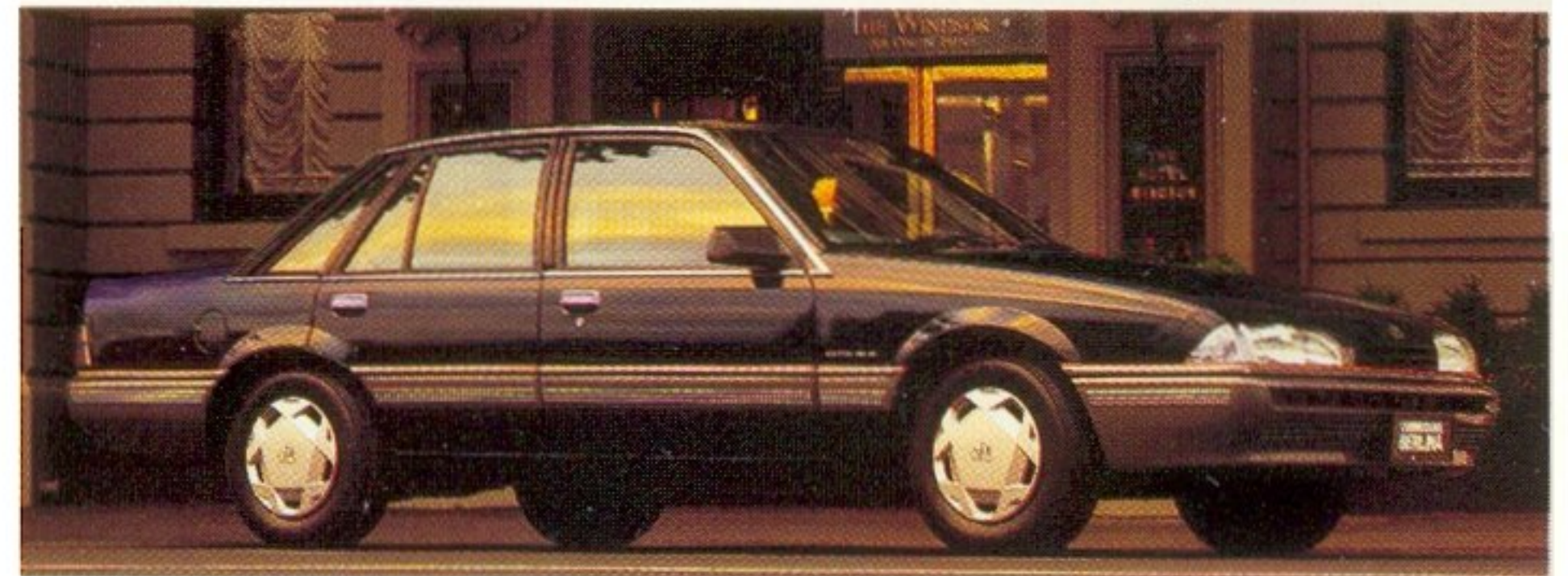
Holden Commodore Berlina Sedan