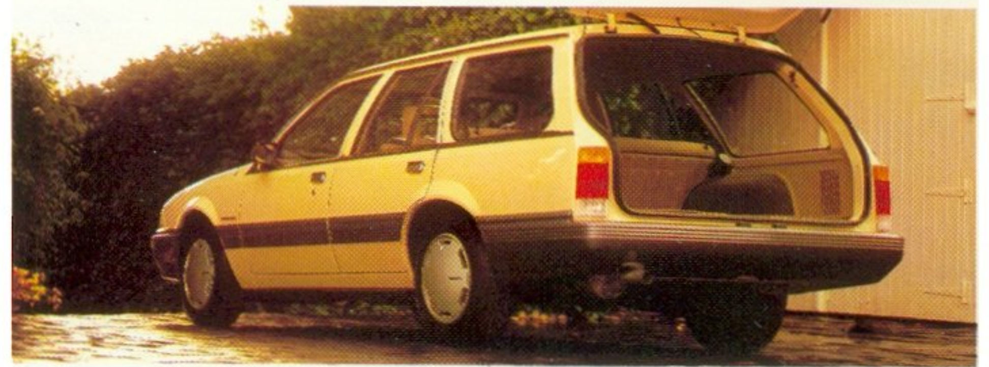
Holden Commodore Executive Wagon