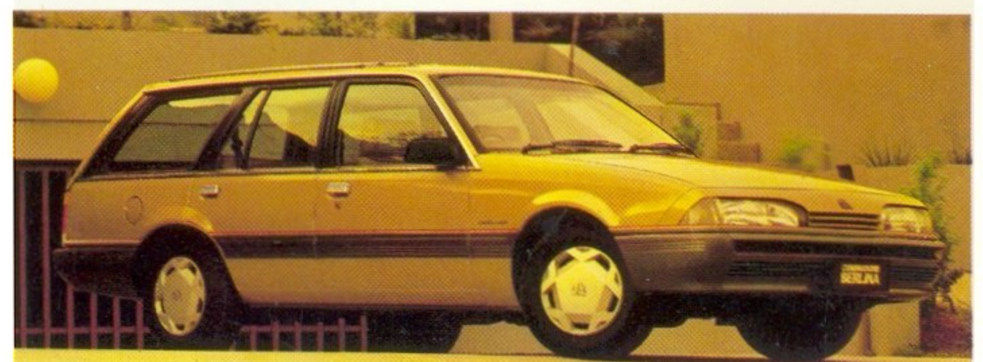
Holden Commodore Berlina Wagon