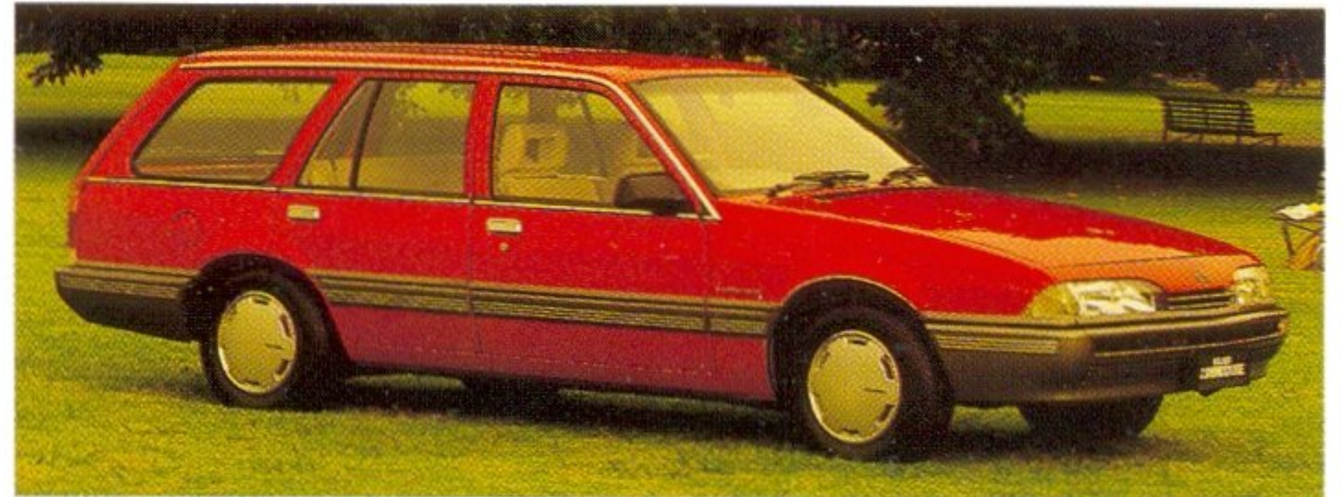
Holden Commodore SL Wagon

And the rear window wash/wipe system is standard on all models.