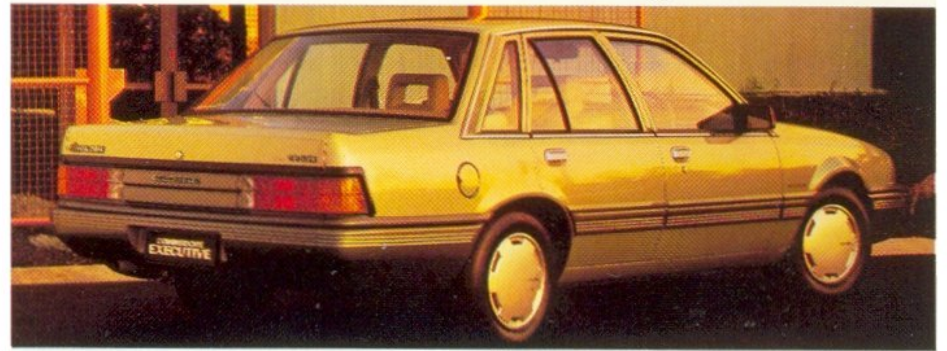
Holden Commodore Executive Sedan