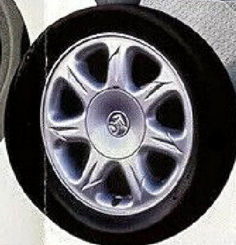
Stylish 15" alloy wheels