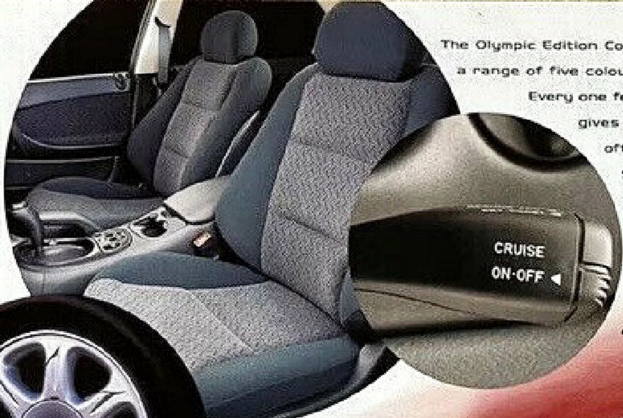
Unique velour seat trim