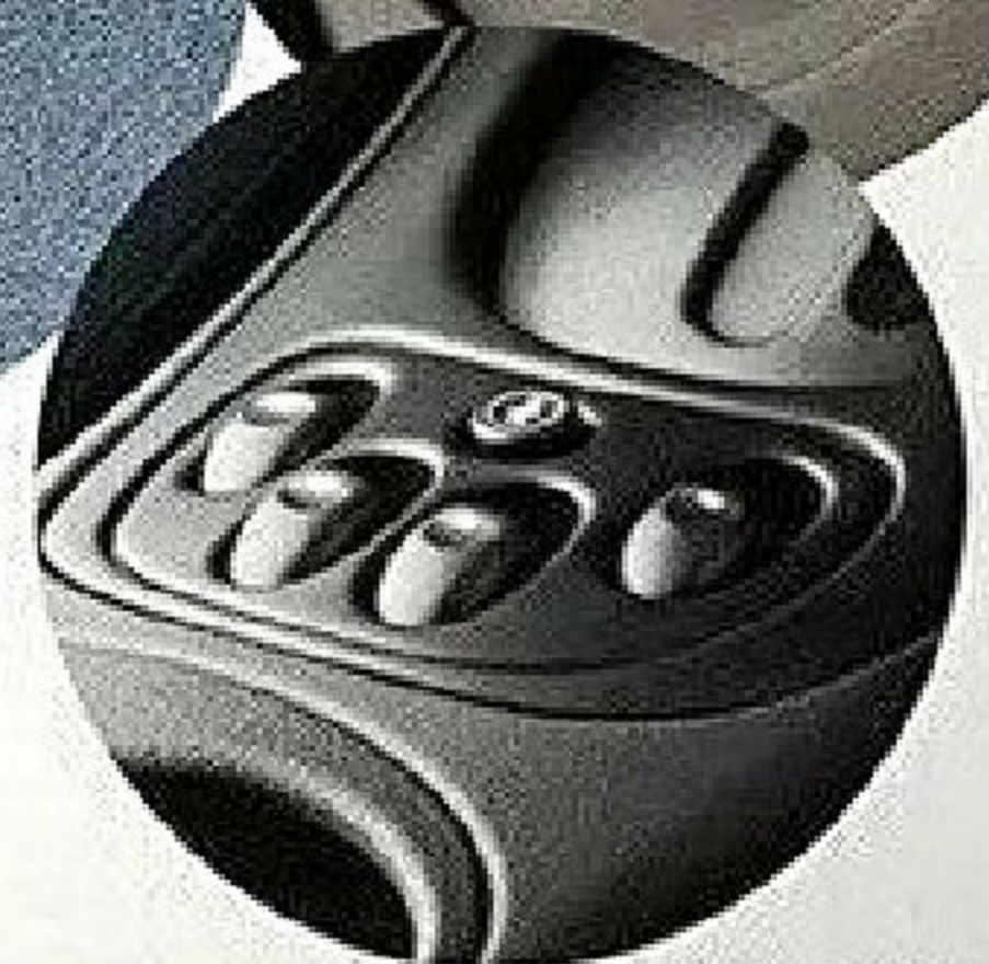
Power windows at the touch of a button