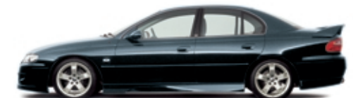
Grey Storm Mica

Available on ClubSport R8, GTS, Signature and Grange