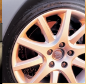
18" Grange alloy wheels.