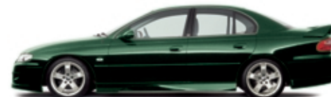
HSV Racing Green

Available from 2001 on ClubSport R8, Signature and Grange