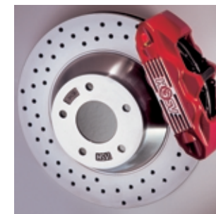
HSV Premium Brakes.

Rear: 315 x 18 mm ventilated & grooved disc.