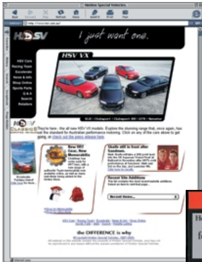
www.hsv.com.au Australia's most popular specialist automotive website.

The excitement of an HSV purchase continues long after you take delivery of your new HSV. HSV ownership gives you access to a new range of benefits and privileges not available to owners of other cars. HSV also provides a wide selection of apparel and merchandise with a distinctive race-bred flavour. HSV knows that HSV owners are more particular than other owners about their driving and their car and provide a wide range of support activities to keep our owners informed and on the road.