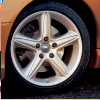
Embellished with its wide front intake, sculptured side skirts and premium rear styling, enhanced by high performance 18" alloy wheels and tyres as standard.

This ClubSport is a more wicked touring and performance car than ever. A beefy new exhaust note never lets you forget that there is the serious muscle of a rippling V8 under its bold new exterior.