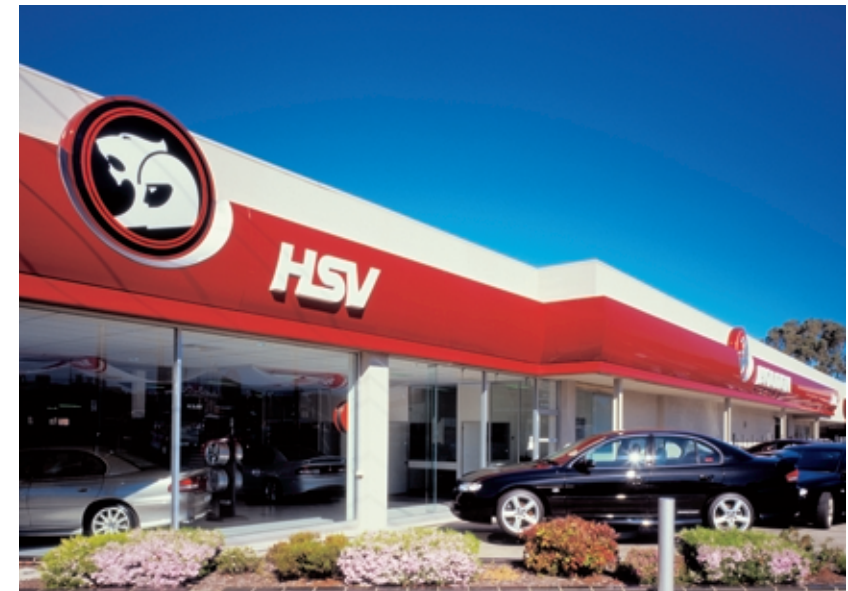
Specialist HSV Retail Sales & Service Centres in Australia & New Zealand

HSV has rapidly earned a reputation as an engineering works of original equipment quality, not just an enhancer of existing models. Special HSV engines include the SV5000 200 kW red engine, the 5.7 litre 215i and 220i GTS engines and the latest 300 kW powerplant developed in a four way collaboration between HSV, GM Powertrain, Holden and Callaway. HSV was also the first local manufacturer to offer a six speed manual transmission, the renowned Hydratrak differential, cross drilled-four piston calliper brakes and the multi-link GTS rear suspension in a single comprehensive package.