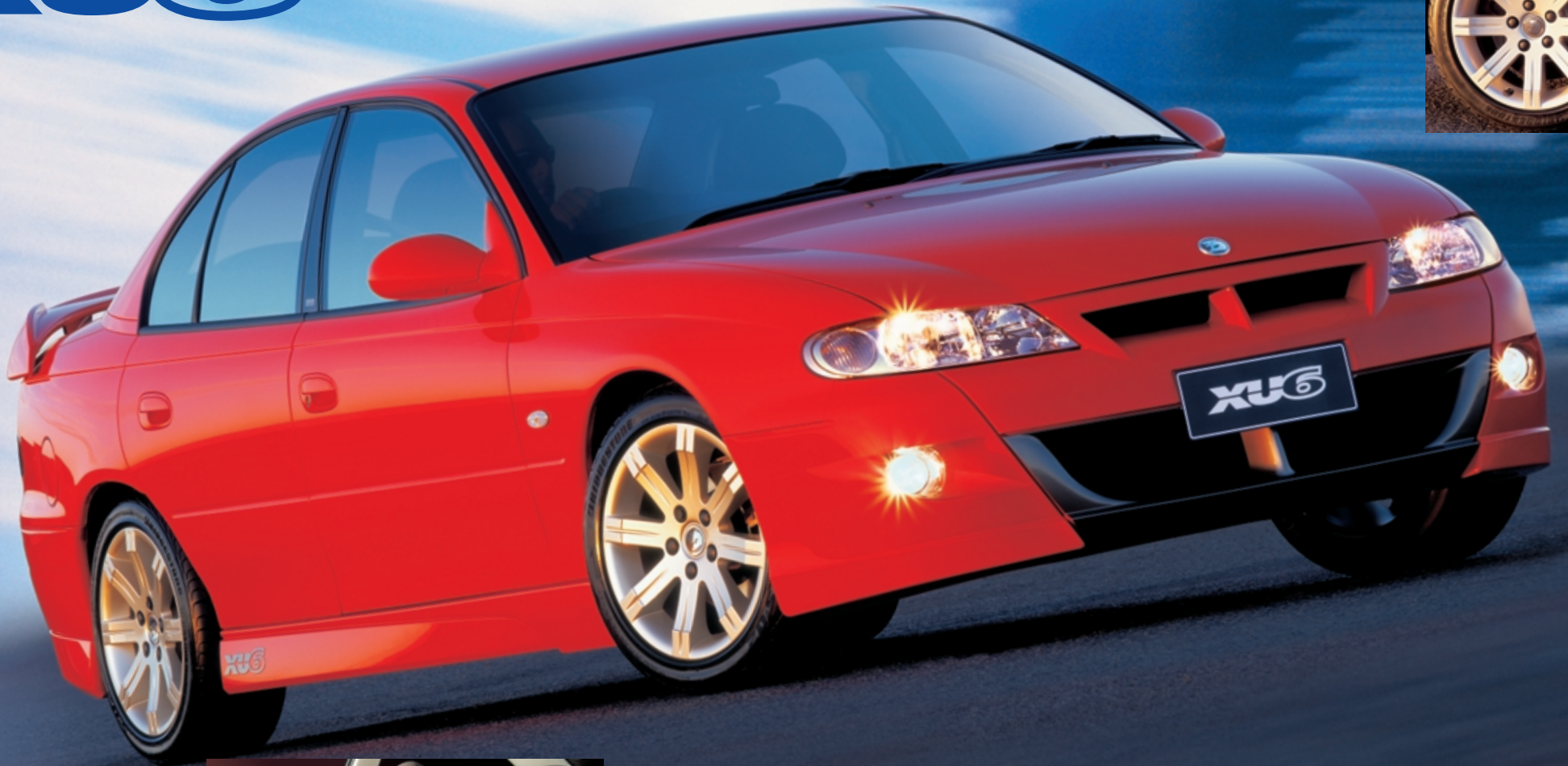
HSV VX XU6 - specific 8 spoke 8" x 17" alloy wheels.