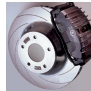
HSV Performance Brakes.

HSV's tailored sunroof is electronically controlled from convenient ceiling mounted controls for preferred positioning in the slide or tilt mode, and even automatically closes when you lock your car.