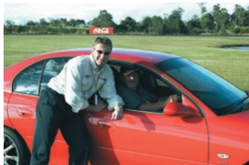
HSV Skaife Driveability. Exclusive premium driving tuition for HSV owners (See your HSV Retailer for pricing information).