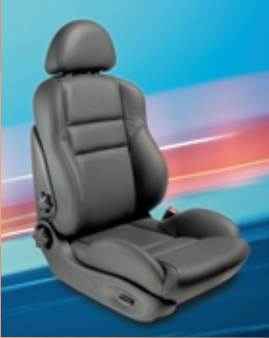
Optional leather performance seats.