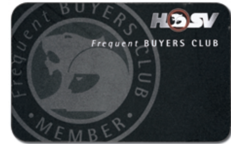
Frequent Buyers Club. For HSV owners who have purchased 3 or more HSV vehicles.

Classics Certified Used HSV Vehicles. Providing peace of mind and treating used HSV owners like new car buyers.