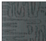
grey woven cloth