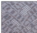
grey moquette cloth (se only)

this colour chart illustrates the available exterior colours for the holden frontera. as these are printed colours and not actual samples, variations between those illustrated and actual paint colours may occur. as such, we recommend that these illustrated colours be accepted as indicative only. certain colours may not be available from time to time, or on certain models. it is important that your holden sales consultant confirms with you such variations by reference to the latest holden ordering procedure.