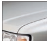
bright silver metallic