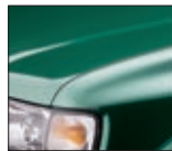
garden green mica