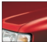
currant red mica