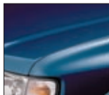
atlantic blue mica