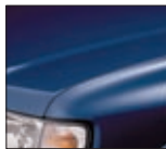
clipper blue mica