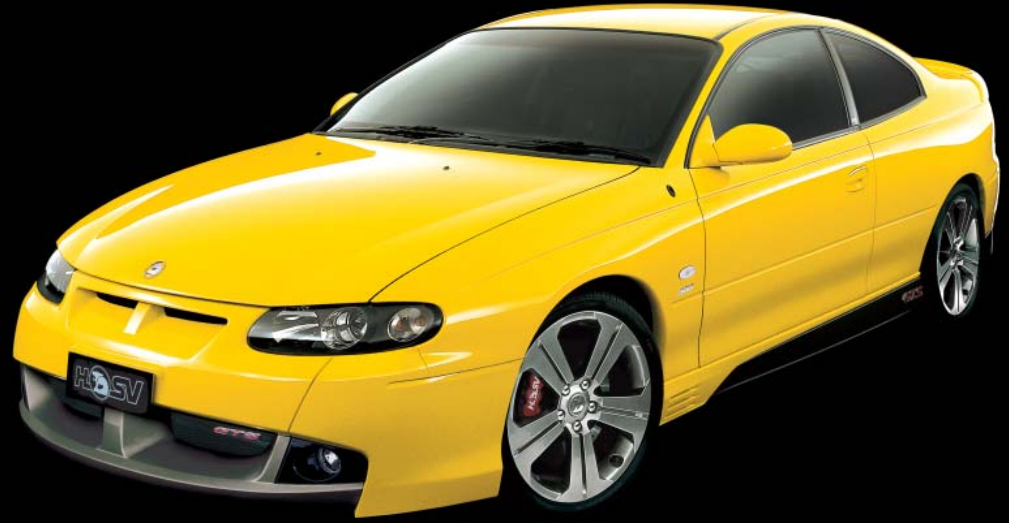
300kW GTS Coupé

We have improved what they said could not be improved. The new HSV Coupé Series 2 is ready. Are you?