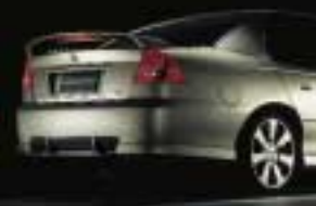
rear 5 pack spoiler