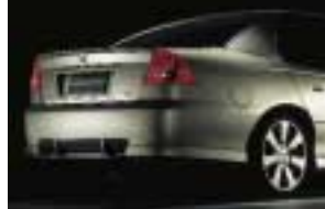
rear lip spoiler