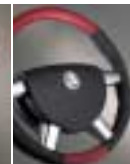
Holden By Design sports profiled handbrake, gear selector and steering wheel are available in Anthracite Grey, Redhot, Bermuda Blue and Cosmo.