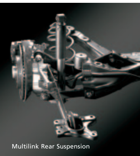
Multilink Rear Suspension