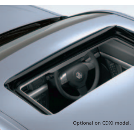
Optional on CDXi model.