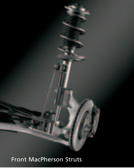
Front MacPherson Struts