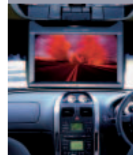
Optional HSV DVD with roof mounted 7" screen

Those who demand a truly luxurious vehicle will find their hopes fulfilled in the awesome Senator & Senator Signature. And in the well-established HSV spirit of continual improvement, everywhere one looks one sees the unerring hand of our most-skilled automotive designers, taking what was already one of the most praised cars in HSV history, and improving, caressing, perfecting. In every driving condition, discerning owners will always find it endlessly rewarding. But we freely concede that it really comes into its own on the open road, effortlessly eating up the kilometres. And be prepared for many admiring glances along the way, as this superbly styled car betokens a certain menacing beauty that always attracts attention.