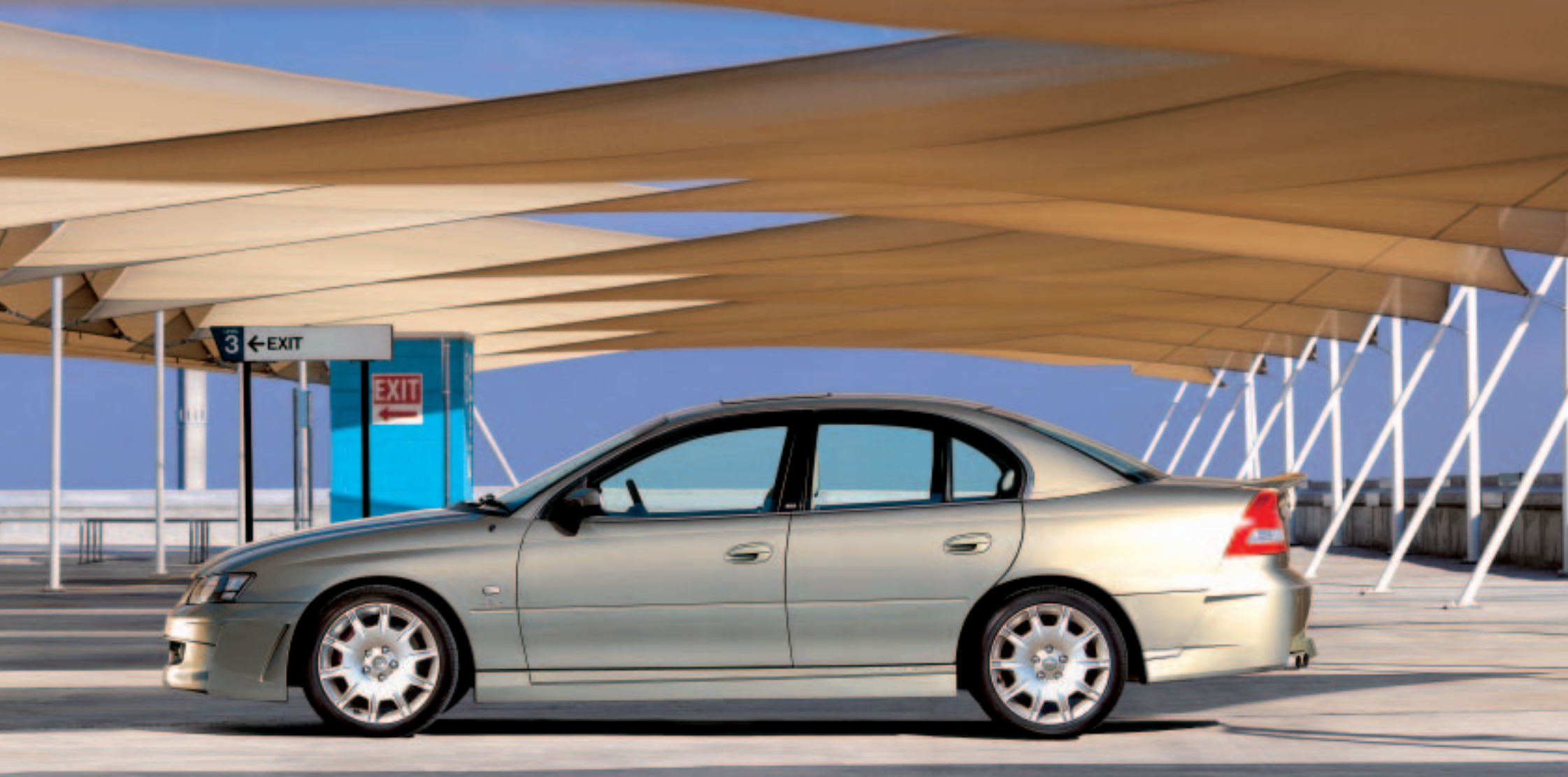
Senator shown with optional at cost Sunroof