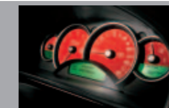
Redhot instrument cluster