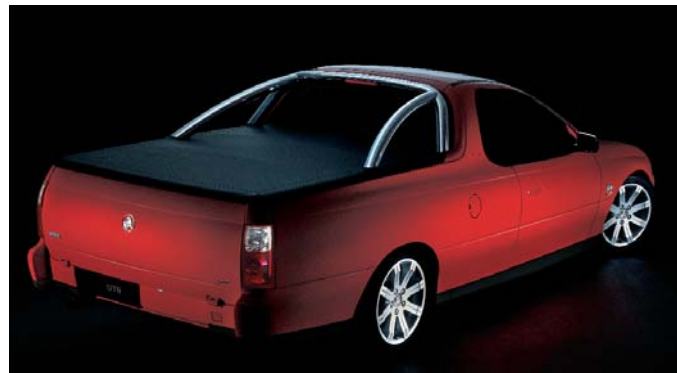
Top: Holden By Design sports profiled steering wheel, gear selector and handbrake are available in Anthracite, Bermuda, Redhot and Cosmo. Above: Sports Bar and Sports Bar tonneau Right: Optional HBD canopy and alloy wheels