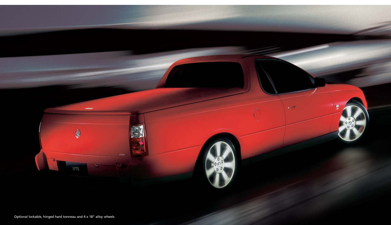
Optional lockable, hinged hard tonneau and 4 x 18" alloy wheels