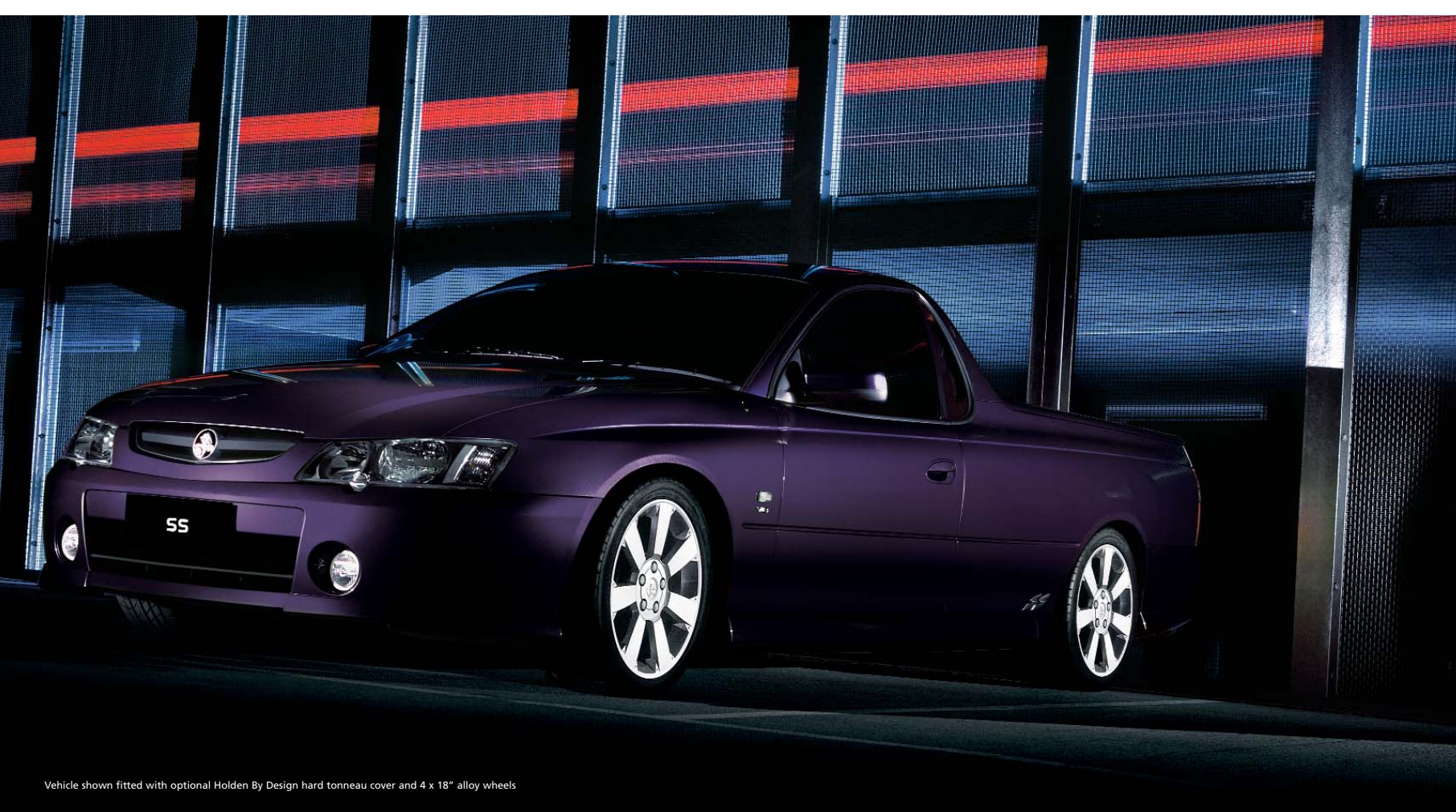
Vehicle shown fitted with optional Holden By Design hard tonneau cover and 4 x 18" alloy wheels