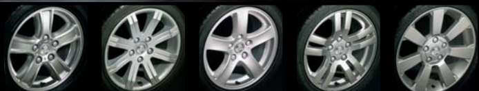
16" 'S' Series