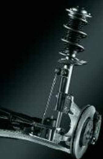
Front MacPherson Struts