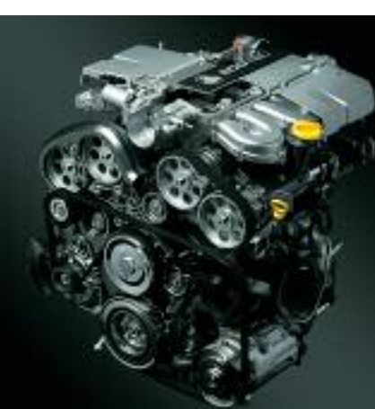
3.2 Litre V6 Engine (155 kW)