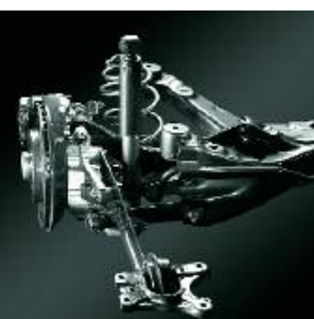
Multilink Rear Suspension