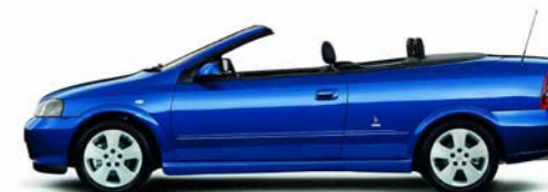
China Blue (metallic)