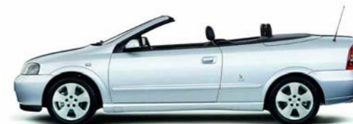
Star Silver (metallic)

MAKE IT YOURS Give Astra Convertible the perfect finishing touch with a colour scheme you love. Select the stunning exterior finish that best suits your personality. Then (depending on which colour you choose) match it with Astra Convertible's superb leather interior trim. You'll never look back.