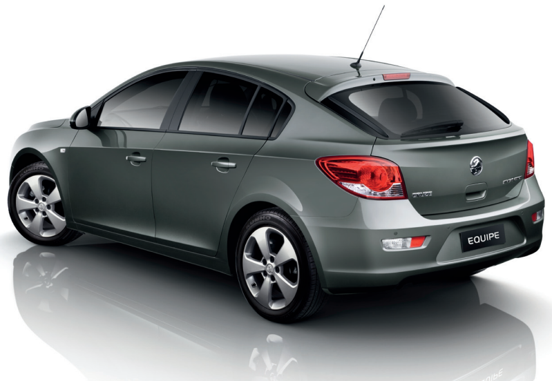
Cover: Cruze Equipe Sedan in Red Hot Above right: Cruze Equipe Hatch in Alto Grey

Available in hatch or sedan, it offers alloy wheels, rear parking sensors and Equipe badging.