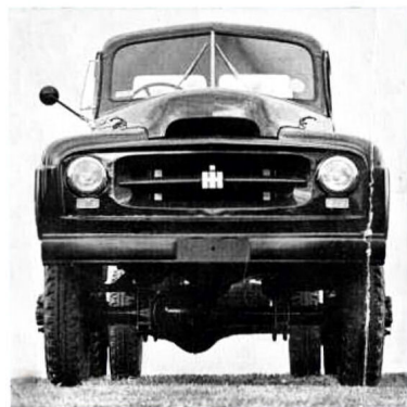
The famous Comfo-Vision cab is specially suited to rugged terrain operation. The natural angle steering and all-round visibility with 13.2 sq. ft. of windscreen provides maximum driver comfort. The high under-axle clearance gives the AR-160 4 x 4 the ability to negotiate tracks with high obstructions or deep ruts. The high position of the front bumper means banks and ditches are easier to negotiate, too.

Highways, bridges, power-stations. Heavy traffic on unmade tracks call for heavy-duty haulage in all weathers. The AR-160 4 x 4 is the answer to the problem of carrying fuel, spare parts, materials and men.