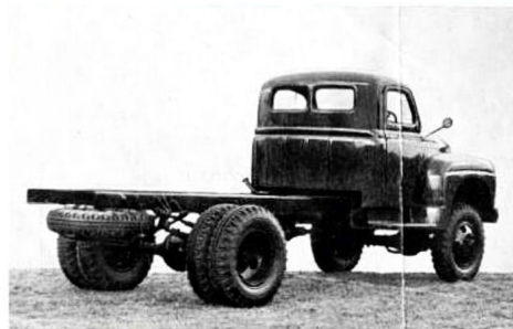
Normal load-carrying capacity with 4-wheel-drive is a big feature of the International AR-160 4 x 4 series. Only 6 inches above normal height, to the top of the frame, the AR-160 4 x 4 is an ideal cargo carrier in off-highway cross-country conditions. The driver can disconnect the front wheel drive with a lever in the cab floor and attain standard truck speeds for highway operation.