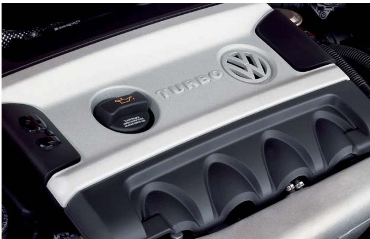
The Polo is powered by a 4 cylinder 1.8l turbo-charged petrol engine.