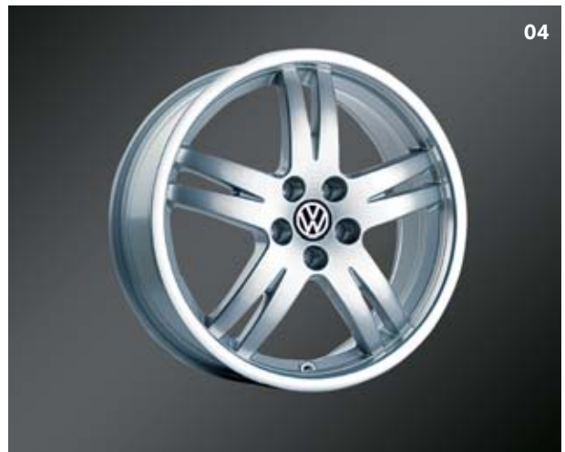
"Siata" 17" Alloy Wheel