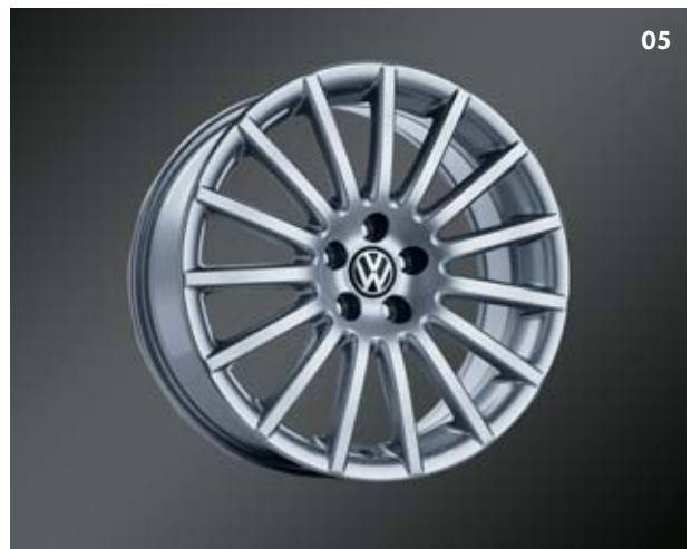
"R Line" 17" Alloy Wheel