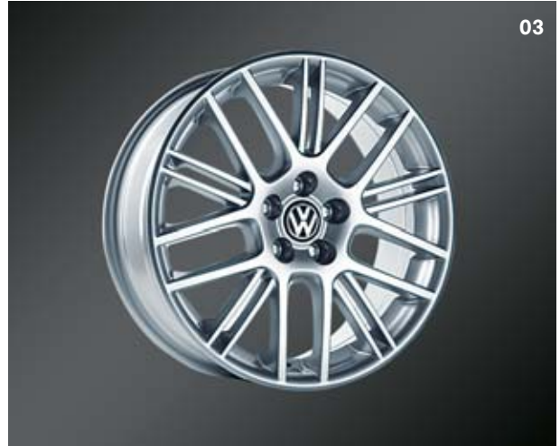
"Exor" 17" Alloy Wheel