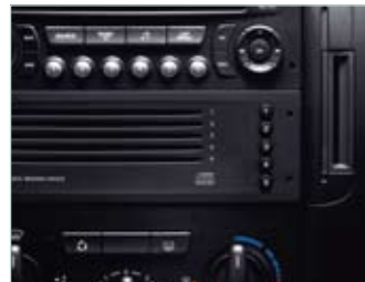
In-dash CD stacker