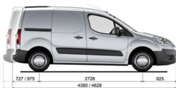
Long version (L2)