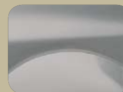
Silky Silver Metallic*