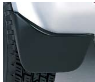
Rear Mud Flap Moulded