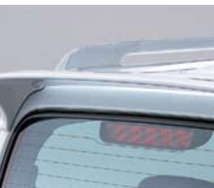
Rear Upper Spoiler

Accessories designed to enhance your off-road adventure.