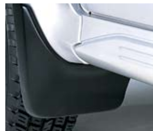
Front Mud Flap Moulded