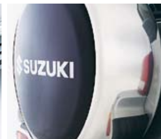
Spare Wheel Cover