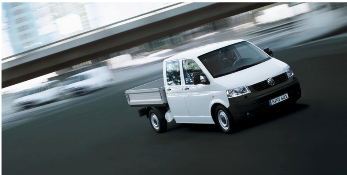
T5 Dual Cab with optional aluminium tray