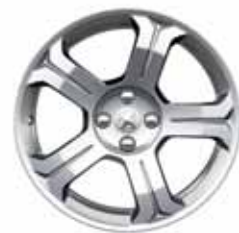
18" Lincancabur Alloy Wheels (308 CC S)