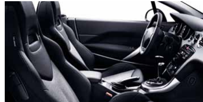
Celestial Black cloth