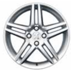
17" Stromboli Alloy Wheels (308 CC)