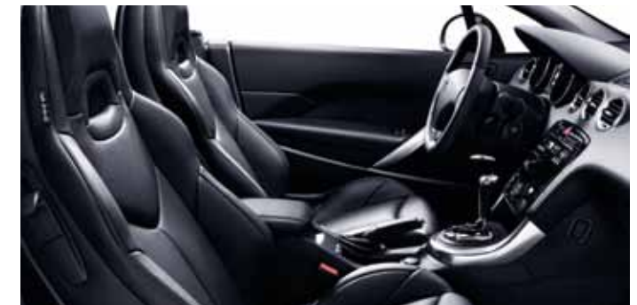
Onyx Black leather