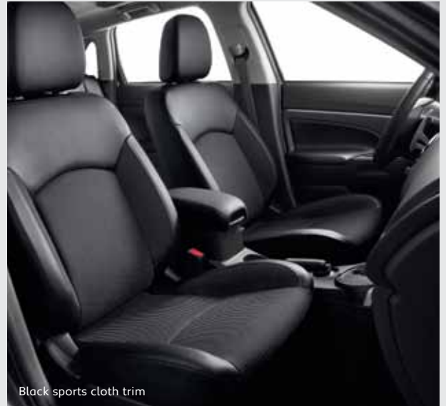
Black sports cloth trim