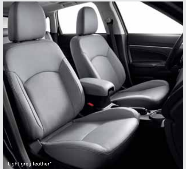
Light grey leather*

*Standard or optional depending on the version.