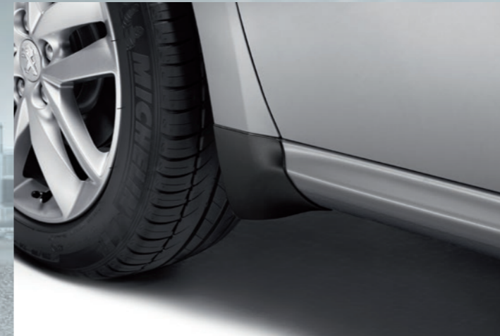
Styled mudflaps — front

Designed to complement the lines of the vehicle while protecting the vehicle's bodywork from damage that can be caused by road debris.