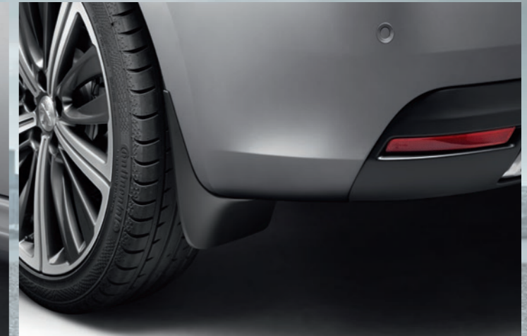
Styled mudflaps — rear