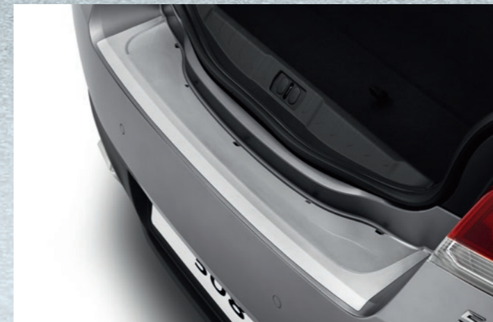
Boot sill protector

Protect your New 508 from knocks and scrapes when loading and unloading from the boot.