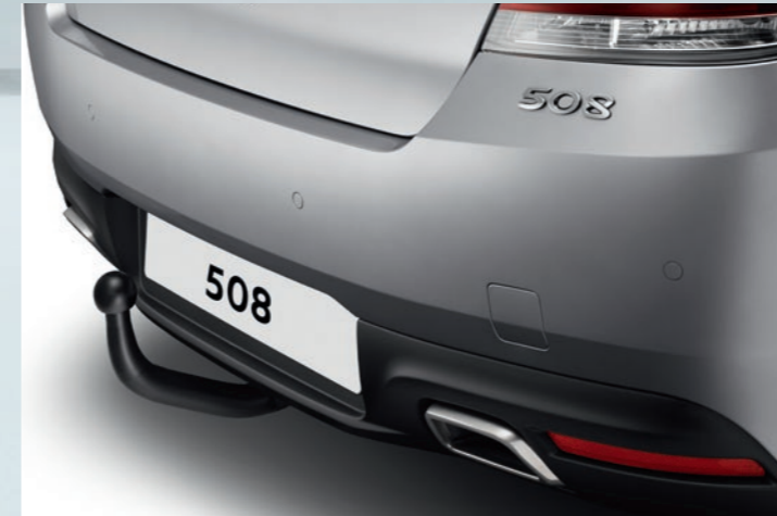
De-mountable tow bar

Designed specifically for the New 508, all of our tow bars are engineered and tested to the highest standards. Available in de-mountable and retractable swan neck configurations dependent on model.