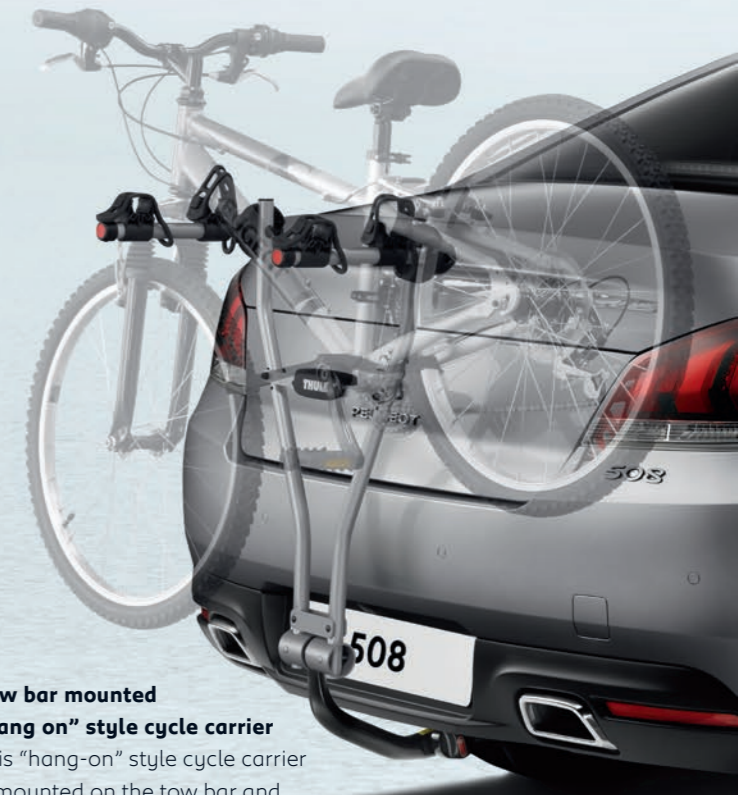
Tow bar mounted "hang on" style cycle carrier

This "hang-on" style cycle carrier is mounted on the tow bar and attached securely to the tow ball for the carriage of up to four cycles. This product must be used in conjunction with a rear lighting board which is available and sold separately.