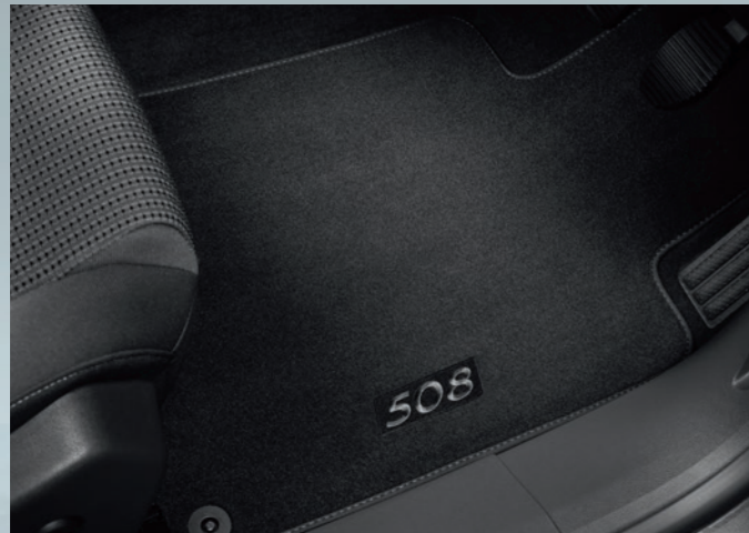
Velour carpet mat set