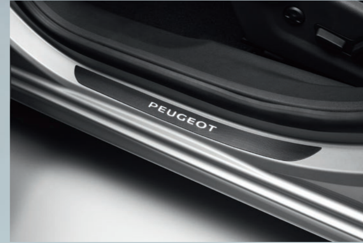
Door sill protectors - carbon fibre effect

Available in a range of finishes, these door sill protectors combine an attractive appearance with effective protection.