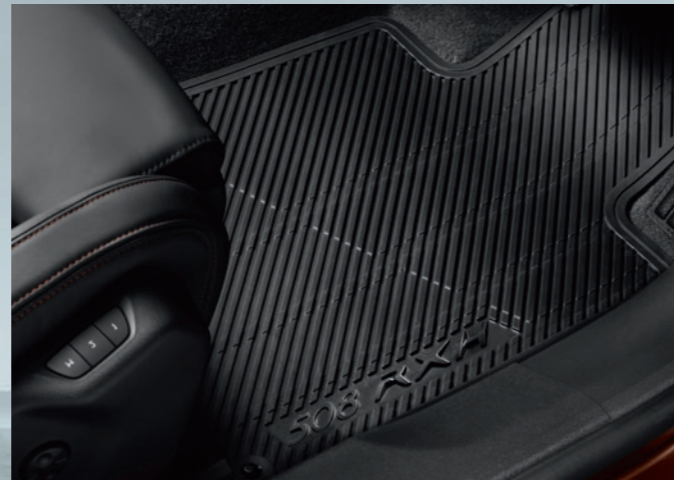
Rubber mat set