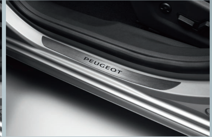
Door sill protectors - dark brushed aluminium effect