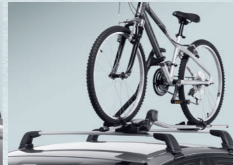
Roof mounted cycle carrier

A convenient alternative to the traditional rigid luggage box, the luggage bag folds flat for easy storage when not in use.