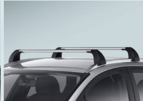
Aluminium roof bars - SW and RXH only