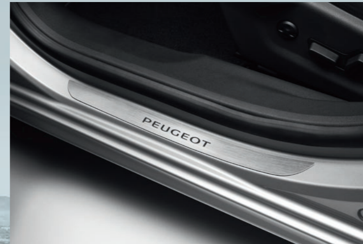
Door sill protectors - brushed aluminium effect