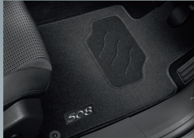
Standard carpet mat set

Available in a choice of materials, these mats will provide lasting protection of the original carpet. To prevent interference with the vehicle's pedals, the driver's side mat clips into the existing fixings.