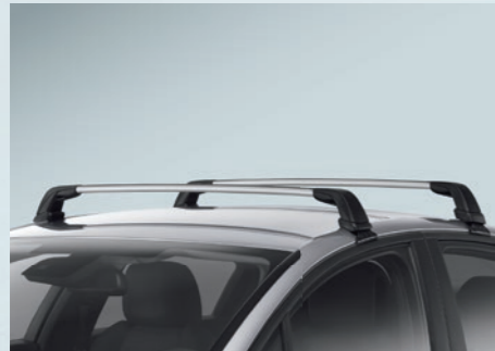
Steel roof bars - Saloon only

A set of transverse roof bars provide an excellent foundation for carrying large items. All roof bars feature a locking mechanism for added security.