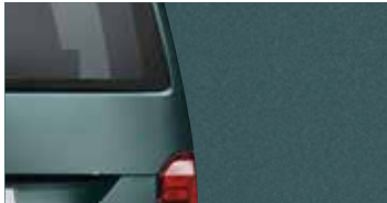
Bamboo Green | Metallic paint finish | 3T3T