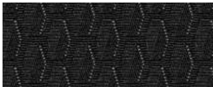
Kutamo Cloth seat upholstery | Titanium Black / Moon Rock Grey