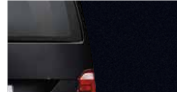
Deep Black | Pearl effect paint finish | 2T2T