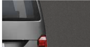
Indium Grey | Metallic paint finish | X3X3