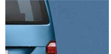
Acapulco Blue | Metallic paint finish | 2W2W