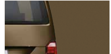
Chestnut Brown | Metallic paint finish | H4H4