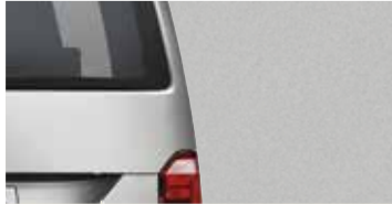
Reflex Silver | Metallic paint finish | 8E8E