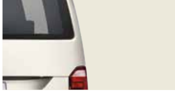
Candy White | Solid paint finish | B4B4