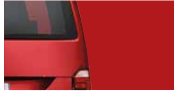
Cherry Red | Solid paint finish | 4B4B