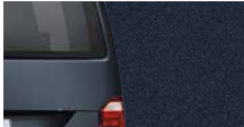
Starlight Blue | Metallic paint finish | 3S3S