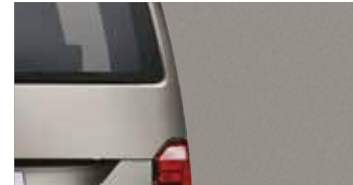
Mojave Beige | Metallic paint finish | 1B1B