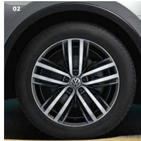
02 Auckland, alloy wheel 19 inch, gloss machined Part. no. 5NA071499NQ9