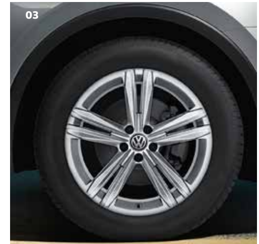
03 Sebring, alloy wheel 18inch, sterling silver Part. no. 5NA07149888Z