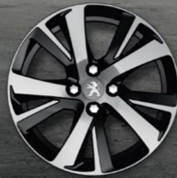
ERIDAN 17" alloy wheel – Glossy Black, diamond-cut***

*Active grade only **Allure grade only ***GT Line only