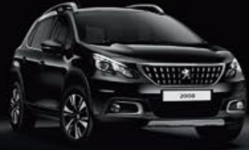
Perla Nera Black