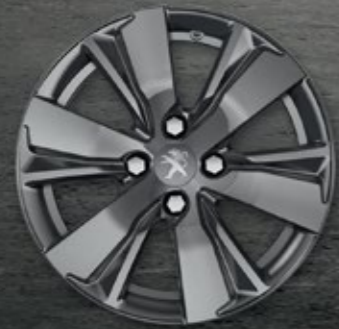
HYDRE 16" alloy wheel – Glossy Dillium Grey*