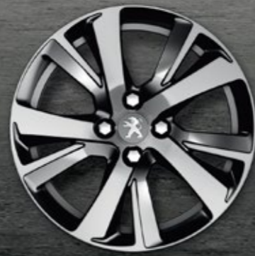
ERIDAN 17" alloy wheel – Glossy Anthra Grey, diamond-cut**