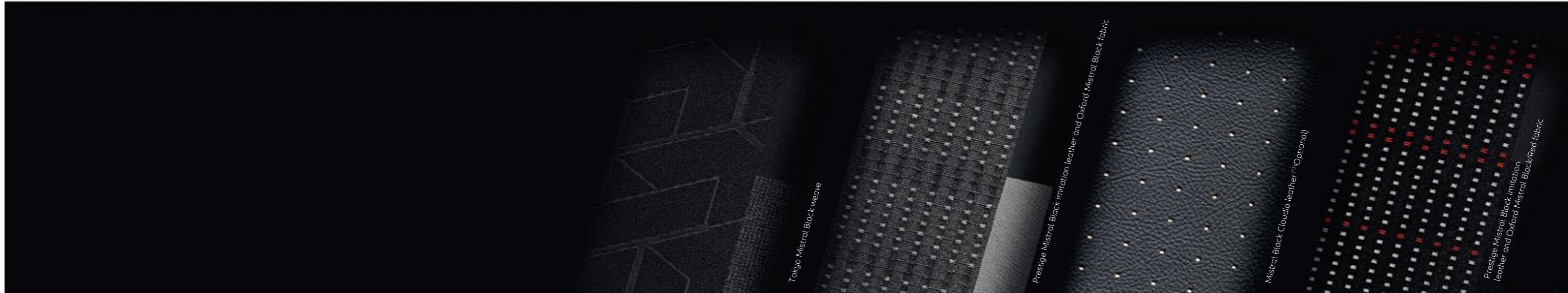
Tokyo Mistral Black weave

*Trims available depending on version. (1) Leather and other materials .