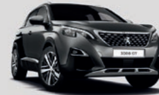
Platinum Grey/Nera Black (CF Met)!