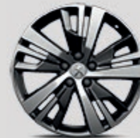
18" "DETROIT" Hario Brilliant two-tone diamond-effect alloy wheels (standard on Allure)