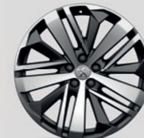
19" BOSTON two-tone diamond-effect alloy wheels (standard on GT)