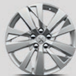
17" CHICAGO alloy wheels (standard on Active)

Attractive 17", 18" or 19" alloy wheels are available depending on the version.