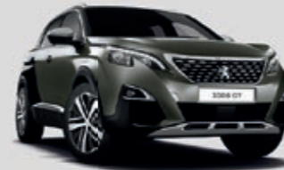
Amazonite Grey/Nera Black (CF Met)!