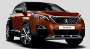
Metallic Copper/Nera Black (CF Met)!