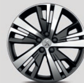
18" "DETROIT" Hario Mat two-tone diamond-effect alloy wheels (standard on GT Line)