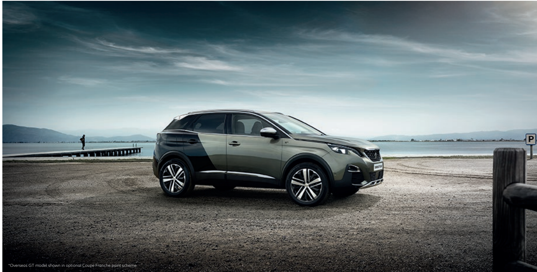
*Overseas GT model shown in optional Coupe Franche paint scheme.