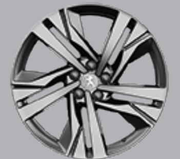
19" 'AUGUSTA' diamond-cut two tone Genuine accessory