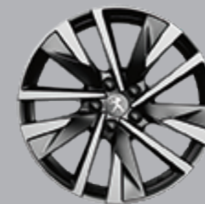
18" 'Sperone' Diamond-cut two tone

(1) Standard, optional or not available depending on version