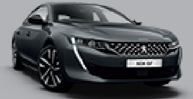
Hurricane Grey (1)