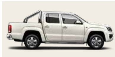
Candy White | Solid paint finish | B4B4