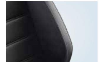
Nappa Leather seat upholstery* | Black with seams in Ceramique

#Leather appointed seats have a combination of genuine and artificial leather, but are not wholly leather.