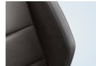
Vienna Leather seat upholstery* | Palladium