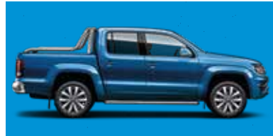
Ravenna Blue* | Metallic paint finish | 5Z5Z *Available on Amarok V6 Ultimate only.