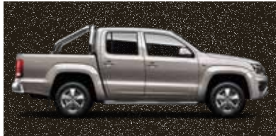
Mojave Beige | Metallic paint finish | 1B1B