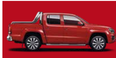
Tornado Red* | Solid paint finish | G2G2