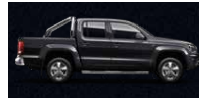
Deep Black | Pearl paint finish | 2T2T