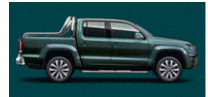
Peacock Green Metallic | Metallic paint finish | 8U8U *Available on Amarok V6 Ultimate only.