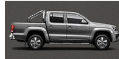
Indium Grey | Metallic paint finish | X3X3