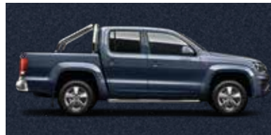
Starlight Blue | Metallic paint finish | 3S3S