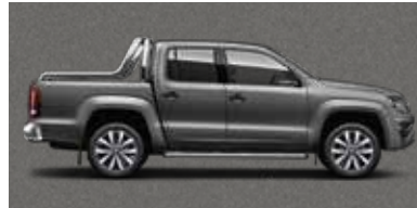
Indium Grey* | Matte paint finish | 9709 *Available on Amarok V6 Ultimate only.