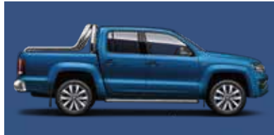
Ravenna Blue* | Matte paint finish | 9547 *Available on Amarok V6 Ultimate only.