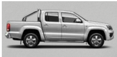
Reflex Silver | Metallic paint finish | 8E8E