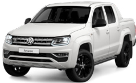
Candy White | Solid | B4B4