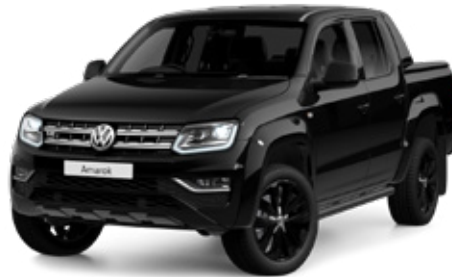
*Deep Black | Pearl effect | 2T2T