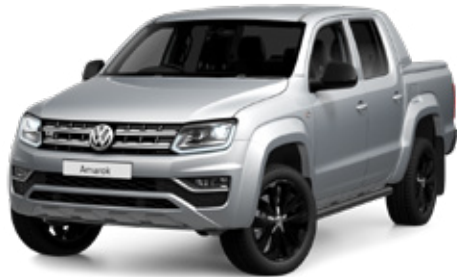
*Reflex Silver | Metallic | 8E8E