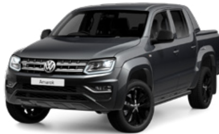
*Indium Grey | Metallic | X3X3

*Please note that Metallic and Pearl affect paint are optional at additional cost.