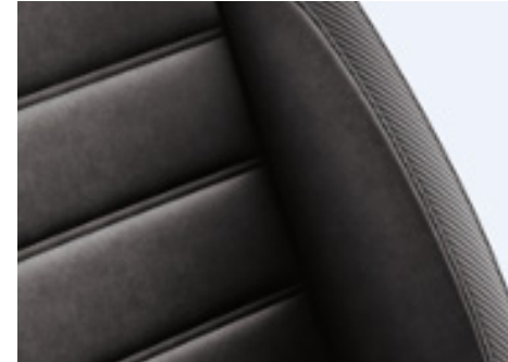
Art Velour | Cloth seat upholstery | Titanium black