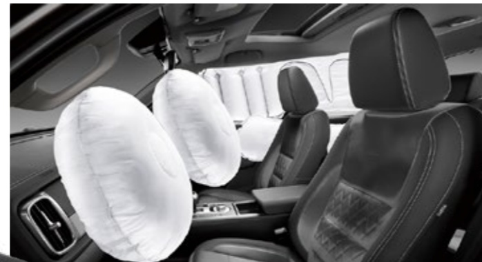
▲ Front, side, centre and curtain airbags ^