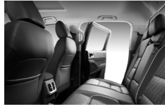
▲ Rear seats^

Don't be fooled by its rugged exterior, the all-new GWM Ute is as comfortable as they come. Experience a smooth ride, even over rough terrain, thanks to the independent front suspension combined with heavy duty rear leaf suspension for outstanding load-carrying.