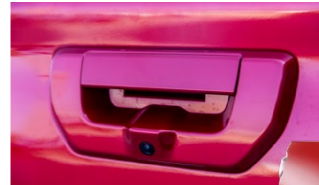
▲ Reversing camera