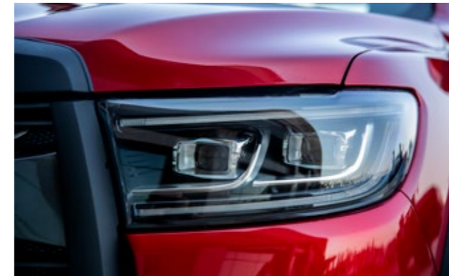
▲ LED headlights with daytime running lights