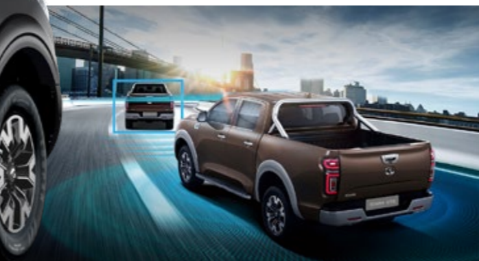
▲ 360 view camera, FCW+AEB, Lane Change Assist & Lane Departure Warning ^