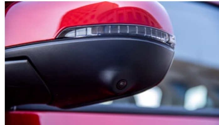
▲ Curbside camera

The GWM Ute was born to tackle the toughest jobs but it was also built smart with a full suite of comprehensive safety systems designed to protect occupants and other road users.