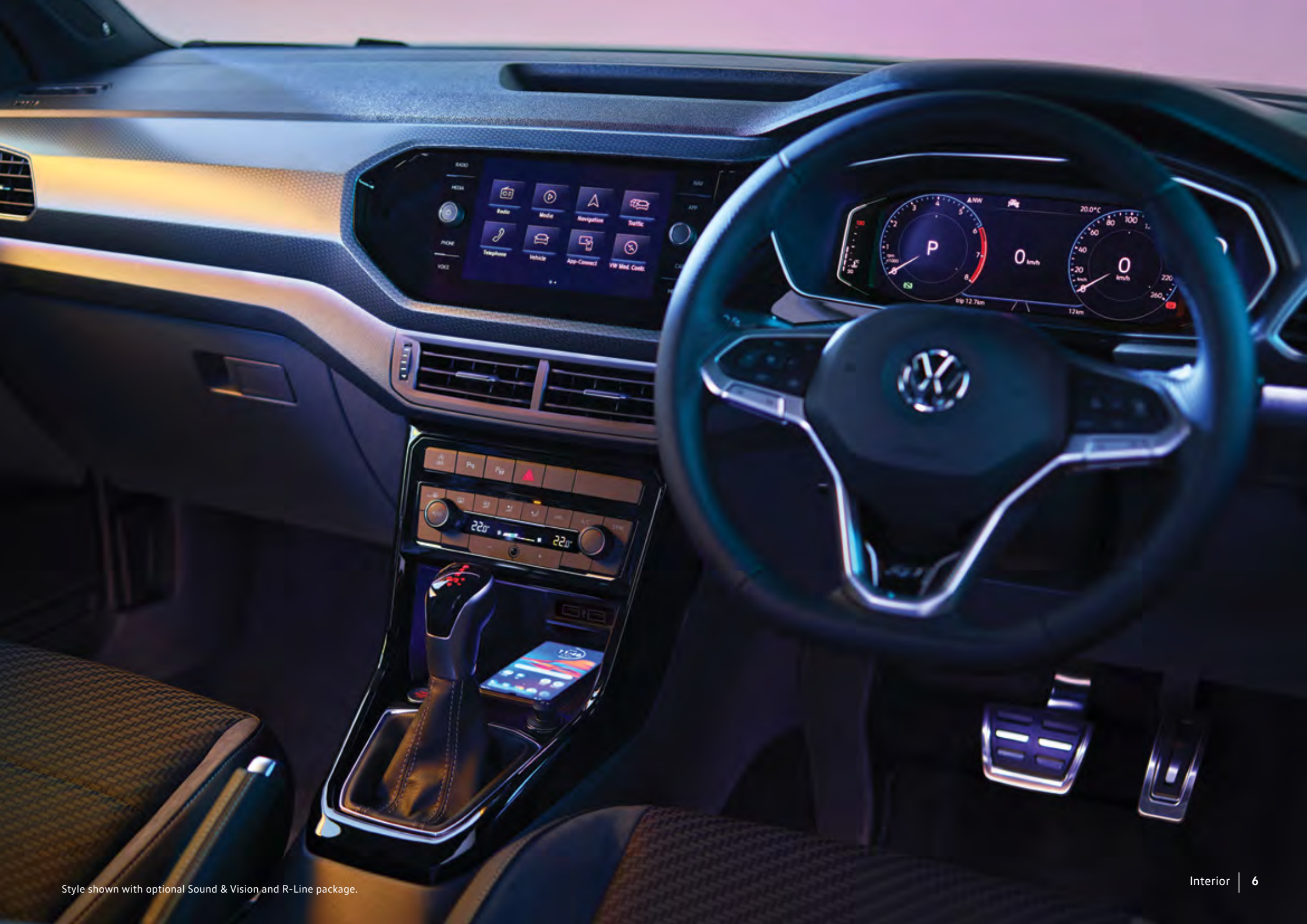
Style shown with optional Sound & Vision and R-Line package.