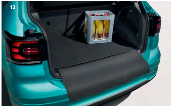
12 Reversible luggage compartment mat

The perfectly fitting, reversible luggage compartment mat helps out when you have sensitive, dirty or damp goods to take. You can choose from soft and gentle velour on one side or sturdy, anti-slip plastic nubs on the other. To make things even easier, a built-in protective cloth can be folded out from the reversible mat to help avoid scratches to the loading sill when you're loading and unloading.