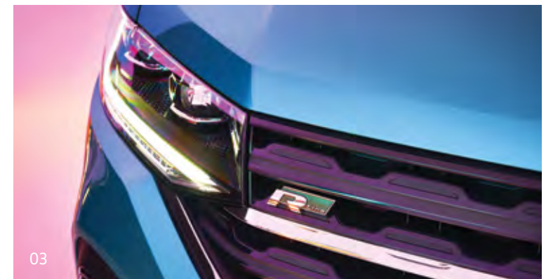
01 Optional Sound & Vision package shown