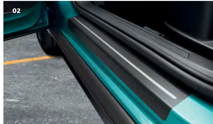
02 Door sill protection film A detail which is both sensible and functional to protect the heavily used door sills in the front and rear entrance areas against scratches and damage. Part.no 2GM071310