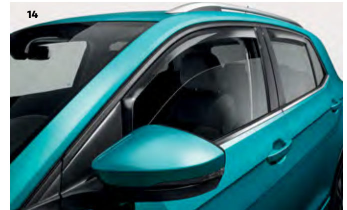
14 Slimline weathershields

Enjoy the circulating fresh air, even when it is raining or snowing, or avoid the unpleasant build-up of heat on hot days by opening the windows slightly.