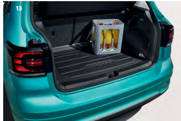
13 Luggage compartment tray

A perfect fit: Can be wiped clean and is acid-resistant, the robust and durable luggage compartment tray with T-CROSS lettering easily keeps your luggage compartment clean.