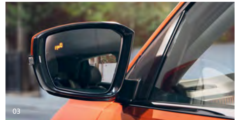
01 App-Connect- featuring Apple CarPlay®