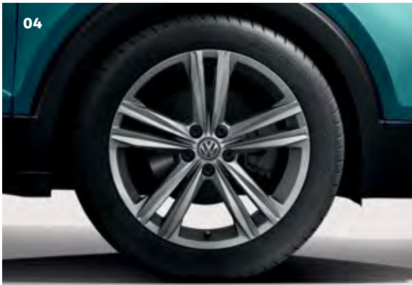
04 Sebring alloy wheel 17" Sebring wheel in grey metallic finish. Part.no 2GM071498FZZ