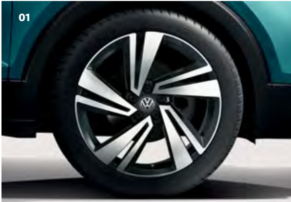
01 Nevada alloy wheel 18" Nevada wheel in gloss machined look. Part.no 2GM071497Z49