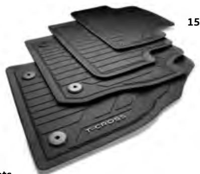
15 Rubber floor mats

Keeping the footwell clean all year round: The perfectly fitting and durable floor mat set with T-Cross lettering on the front mats are attached to the vehicle floor using the integrated fastening system to prevent slipping.