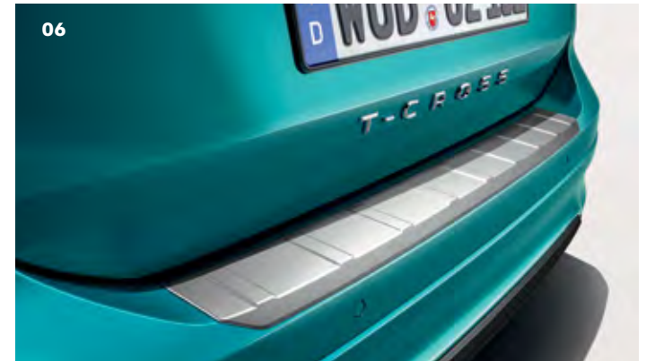
06 Loading sill protection plate The loading sill protection in stainless steel provides instant, stylish protection for an even more premium look to your vehicle. Part.no 2GM061195