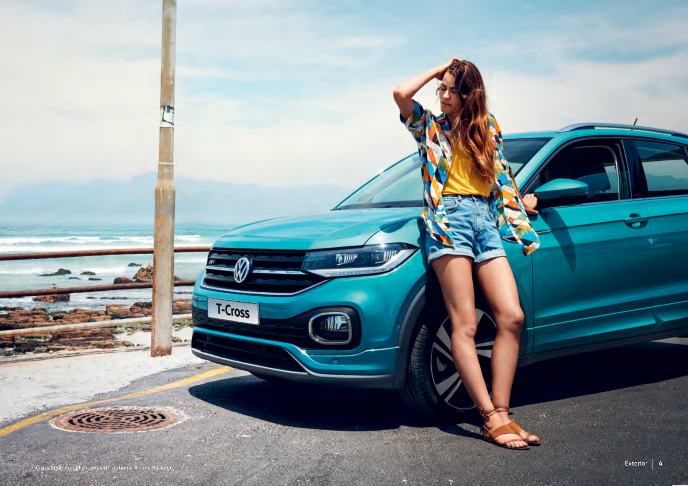
T-Cross Style model shown with optional R-Line Package.