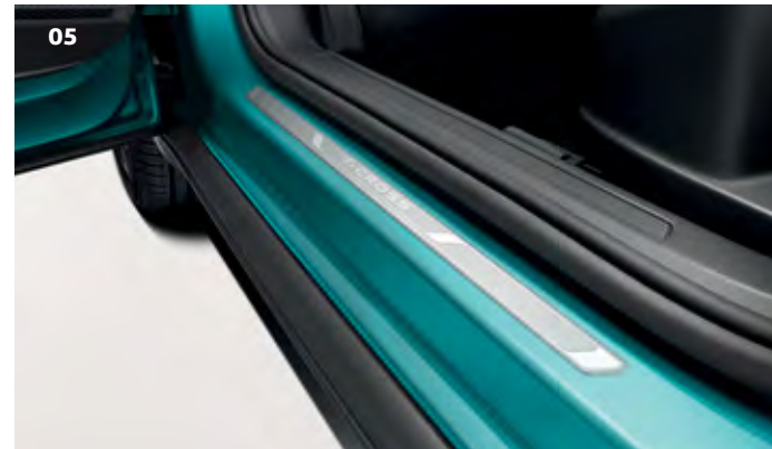
05 Door sill protection plate The high-quality aluminium door sill plates with T-Cross lettering not only protect the heavily used entrance area but adds a more premium look to your vehicle. For the front. Part.no 2GM071303