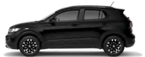
Deep Black Pearl

Please note that metallic and pearl effect paint are optional at extra cost. The print process does not allow for exact reproduction of the exterior or the upholstery colours. Please contact your Volkswagen Dealer for further information on colours and upholstery combinations.