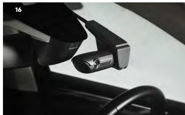
16 Universal Traffic Recorder