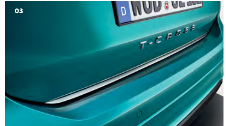
03 Tailgate protective strip The protection strip in high-gloss chrome protects the tailgate edges and adds to the appearance of the vehicle. Part.no 2GM071360