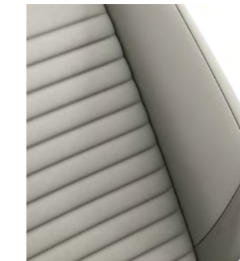
Passat Elegance - Mistral Nappa (Optional) Leather appointed#