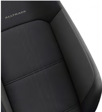
Passat Alltrack - Titan Black Cloth