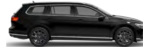
Deep Black Pearl Effect