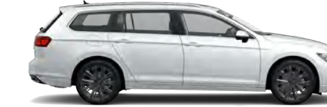
Glacier White Metallic