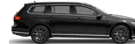
Manganese Grey Metallic