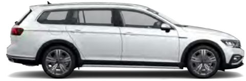
Glacier White Metallic