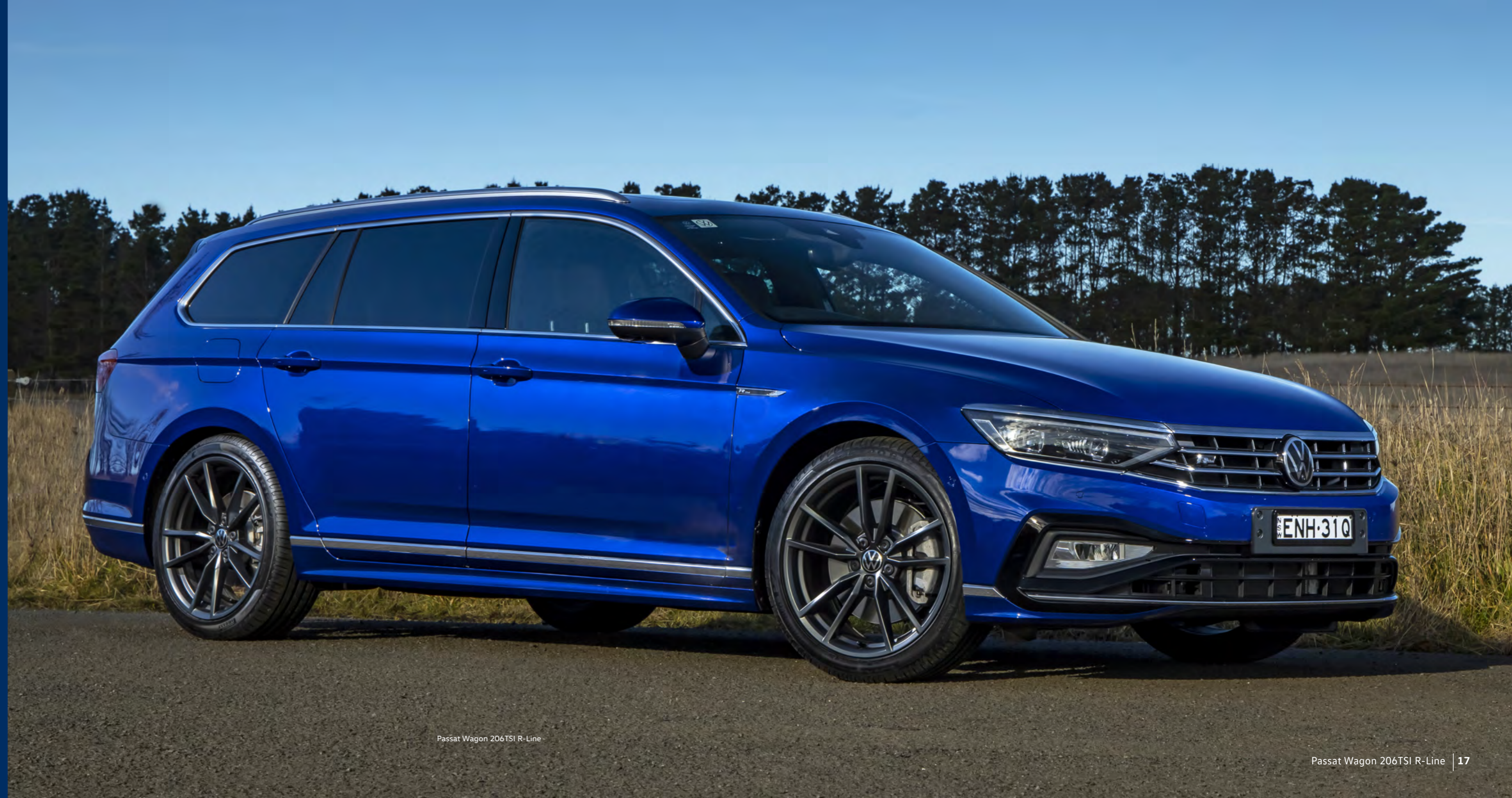
Passat Wagon 206TSI R-Line

Proving that the Passat Wagon 206TSI R-Line never forsakes comfort for pure driving performance are additional conveniences designed to pamper and surprise. Heated and electric front seats with driver massage are the epitome of comfort, while easy entry and memory function makes it easy to find a supported seating position. For the perfect mood-setter, the Passat Wagon 206TSI R-Line also allows you to choose from among 30 ambient interior light colours.