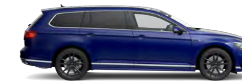
Lapiz Blue Premium Metallic*