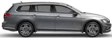
Pyrite Silver Metallic