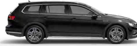
Manganese Grey Metallic