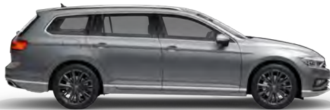
Pyrite Silver Metallic