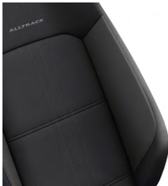
Passat Alltrack - Titan Black Cloth