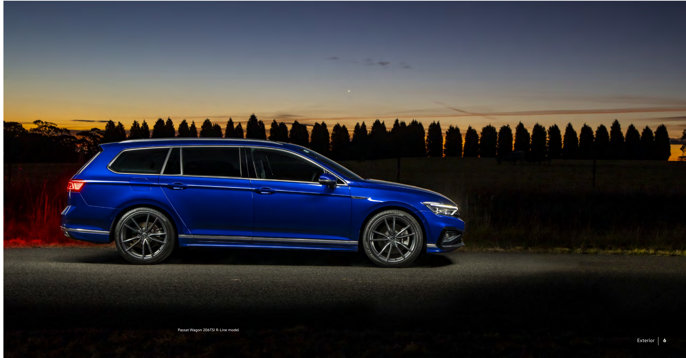
Passat Wagon 206TSI R-Line model