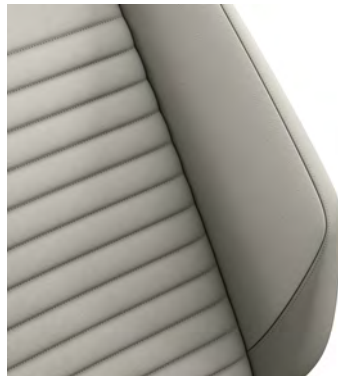
Passat Elegance - Mistral Nappa (Optional) Leather appointed#