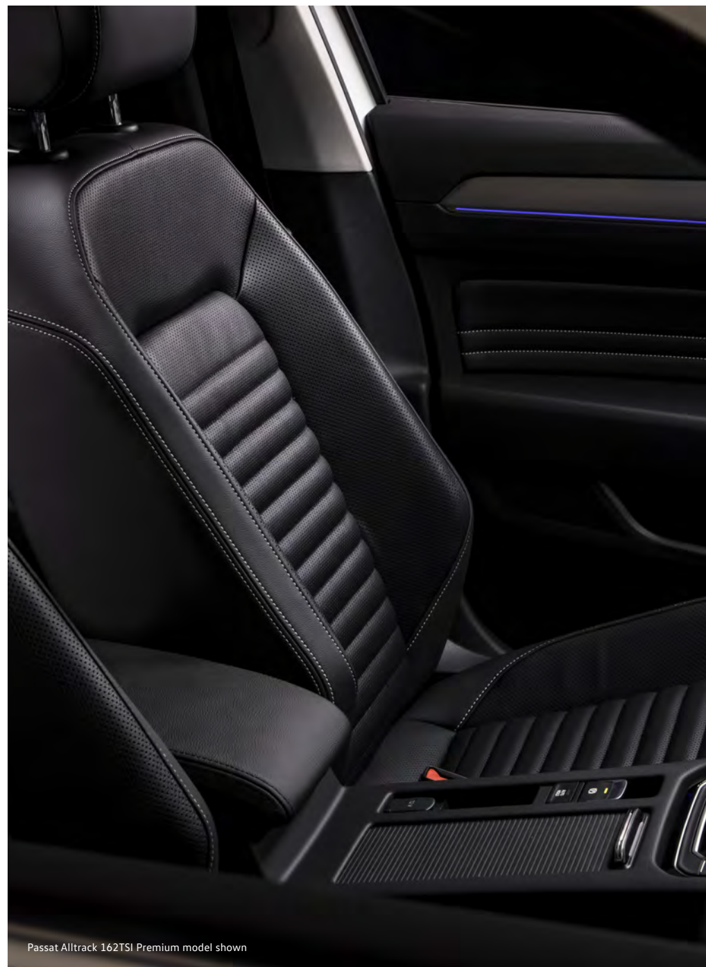
Passat Alltrack 162TSI Premium model shown