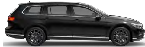
Manganese Grey Metallic