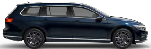
Aquamarine Blue Premium Metallic