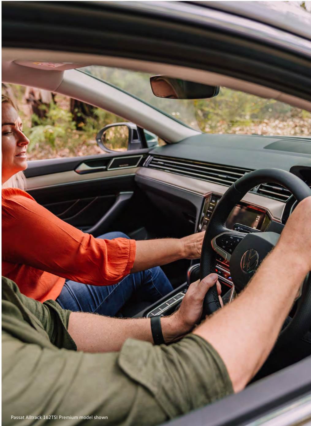
Passat Alltrack 162TSI Premium model shown