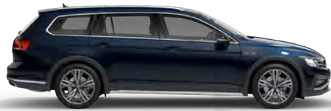
Aquamarine Blue Premium Metallic