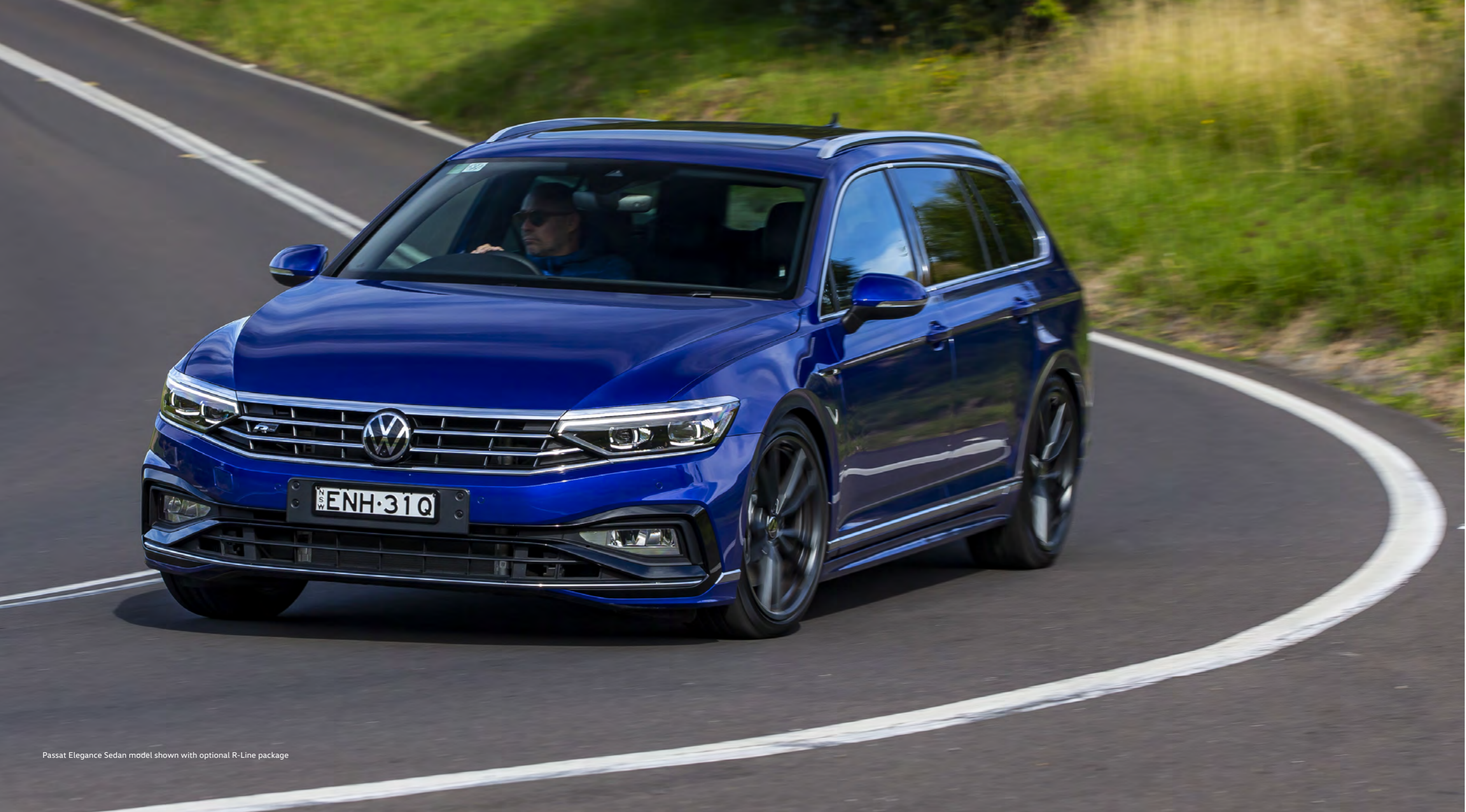
Passat Elegance Sedan model shown with optional R-Line package