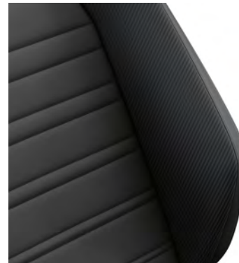
R-Line Black Nappa (Optional) Leather appointed#