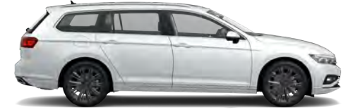
Glacier White Metallic