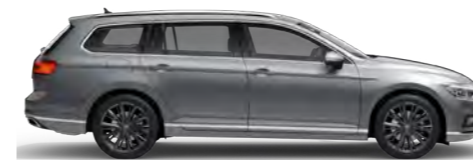
Pyrite Silver Metallic