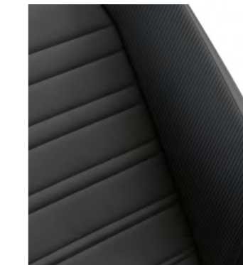
R-Line Black Nappa (Optional) Leather appointed#

#Leather appointed seats have a combination of genuine and artificial leather, but are not wholly leather.