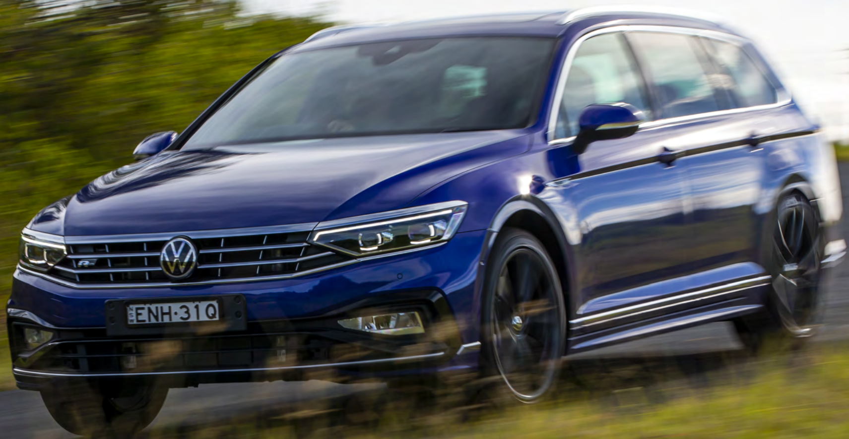
Passat Wagon 206TSI R-Line