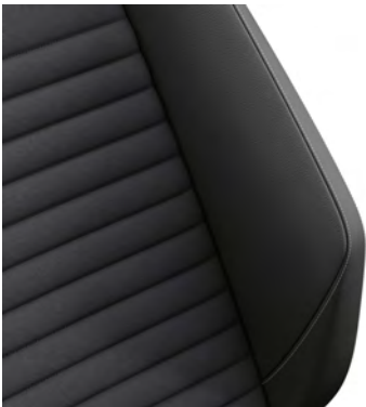
Passat Elegance - Titan Black Nappa Leather appointed#