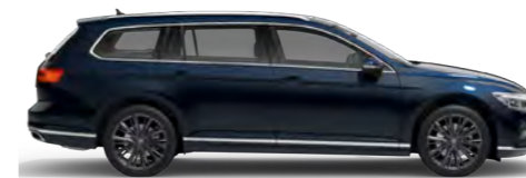
Aquamarine Blue Premium Metallic