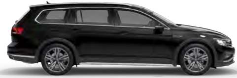
Deep Black Pearl Effect