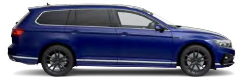
Lapiz Blue Premium Metallic*