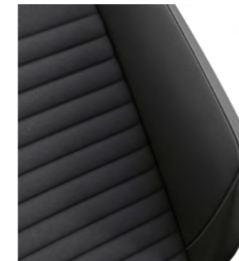
Passat Elegance - Titan Black Nappa Leather appointed#