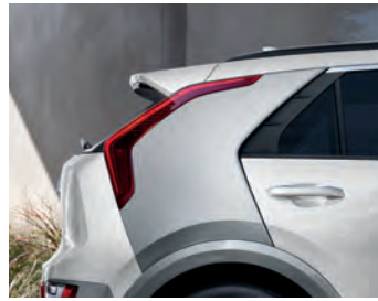
Snow White Pearl with Grey C-Pillar and side garnish**

* Not available on Premium trim models. ** Only available on Limited trim models. Some seating, paint and trim configurations may be limited. Visit kia.ca for full details.