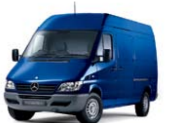
jasper blue metallic*