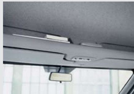
The stowage space above the windscreen, available as an optional extra, offers room for all those things you want to keep within easy reach.