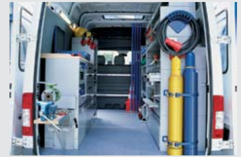
Optimal use can be made of the space inside, even with interior fittings in the load compartment.

To start with, there are three different wheelbase options: extra short (3,000 mm), short (3,550 mm) and long (4,025 mm).