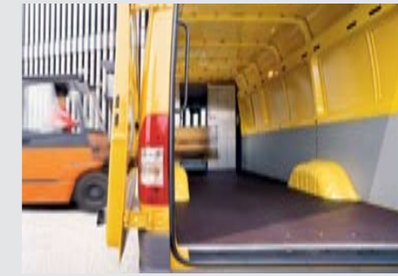
Easy loading of pallets from the rear. Optional 270 degree barn doors.