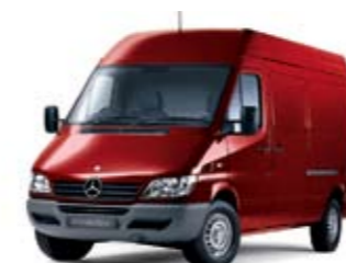
amber red metallic*

The colours depicted here are as close as the printing process allows us. Please contact your dealer for colour samples.