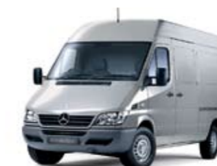
brilliant silver metallic*