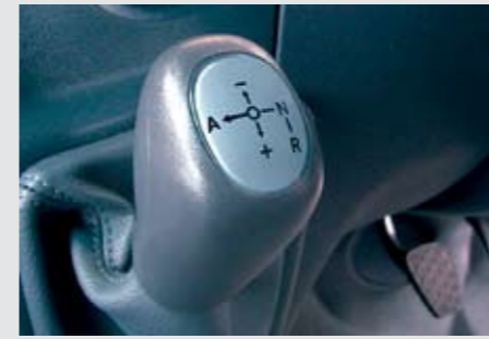
The Sprintshift automated manual transmission: change gears automatically or by nudging the shift lever all without the need for a clutch pedal.