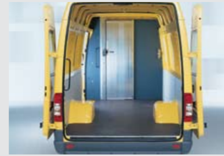
Optional rear hinged doors with wide opening angle of 270 degrees.

Big on the inside and easy to manoeuvre on the outside, Sprinter Panel Vans are filled with intelligent features that are designed to increase your productivity and boost your bottom line.