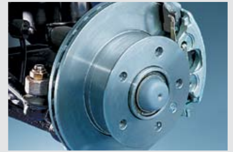
Disc brakes all round - a key safety feature.