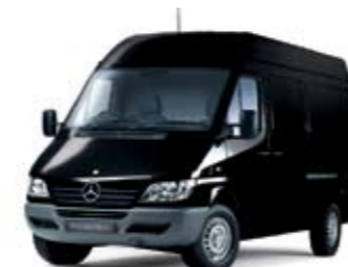
carbon black metallic*