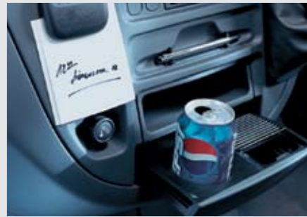
Cupholder, Notepad, Clip penholder.

Genuine spare parts are competitively priced and Sprinter's engines offer remarkable fuel efficiency thanks to the technically advanced CDI Common-Rail Direct Injection process and outstanding aerodynamics.