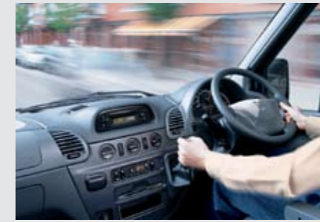
Helping you to focus on the most important thing: driving. The ergonomic instrument panel has an integral, joystick-style gearshift, which makes through-cab access and access to the passenger side and the rear even easier.