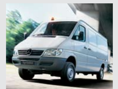
Selectable all-wheel drive as an option for improved traction.