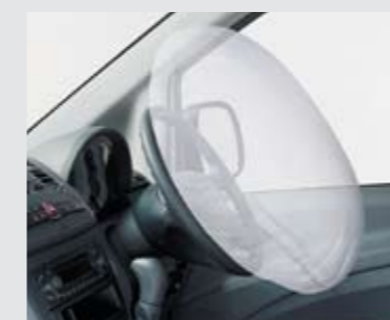
Extra safety: driver airbag standard.