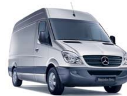
brilliant silver metallic*