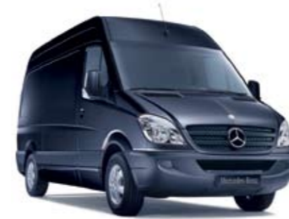
carbon black metallic*

Colours depicted here are as close as the printing process allows us.