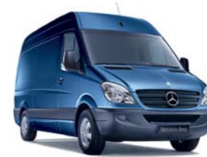
jasper blue metallic*