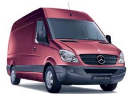
amber red metallic*