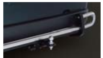
TOWBAR WITH REAR STEP AND PROTECTOR Available on all models