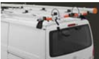
ROOF RACKS - FULL TECHNICIAN KIT Available on LWB