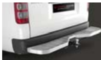
TOWBAR WITH TECHNICIAN STEP Available on LWB