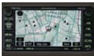
SATELLITE NAVIGATION AUDIO SYSTEM** INCL. 4 IN-DASH CD/MP3 Available on all models