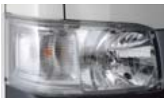
HEADLAMP COVERS Available on all models