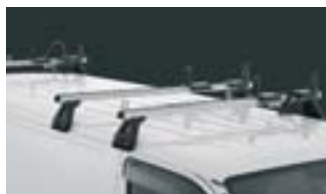
ROOF RACKS - STANDARD KIT Available on LWB