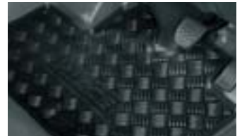
ALL WEATHER RUBBER FLOOR MATS Available on all models