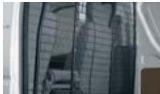
CARGO BARRIER Available on LWB & SLWB