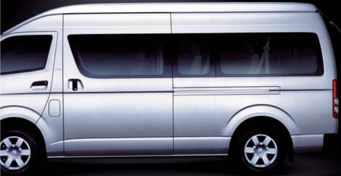
Commuter Bus model shown.