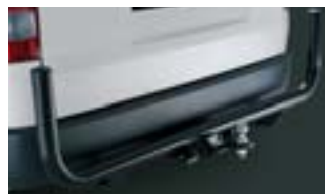
TOWBAR WITH REAR CORNER PROTECTOR Available on all models