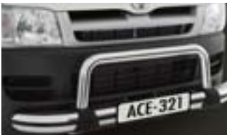
ALLOY NUDGE BAR Available on all models

THESE ARE JUST SOME OF THE ACCESSORIES AVAILABLE FOR YOUR HIACE. FOR A COMPLETE LIST AND FURTHER DETAILS, PLEASE SEE YOUR TOYOTA DEALER OR REFER TO OUR WEBSITE.