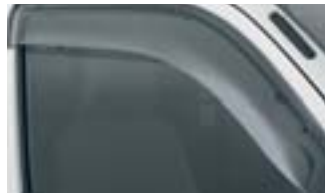
FRONT WEATHERSHIELDS Available on all models