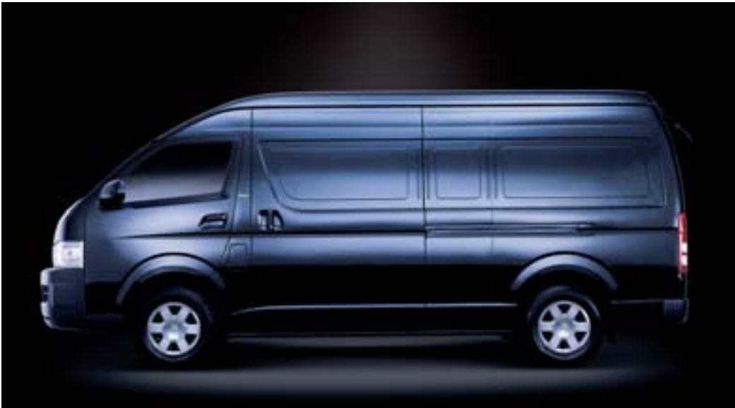
Super Long Wheel Base model shown.