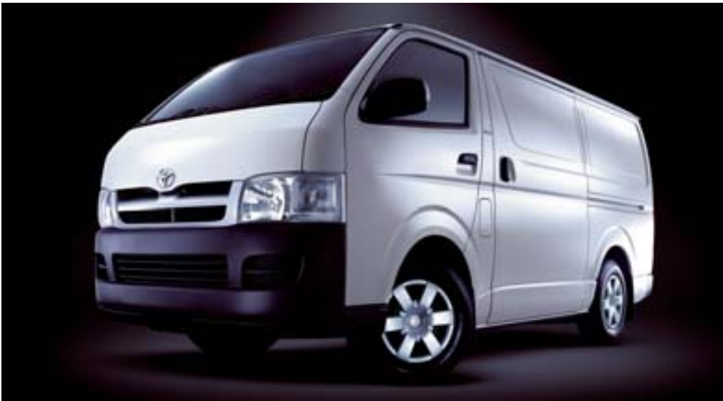
Long Wheel Base model shown.